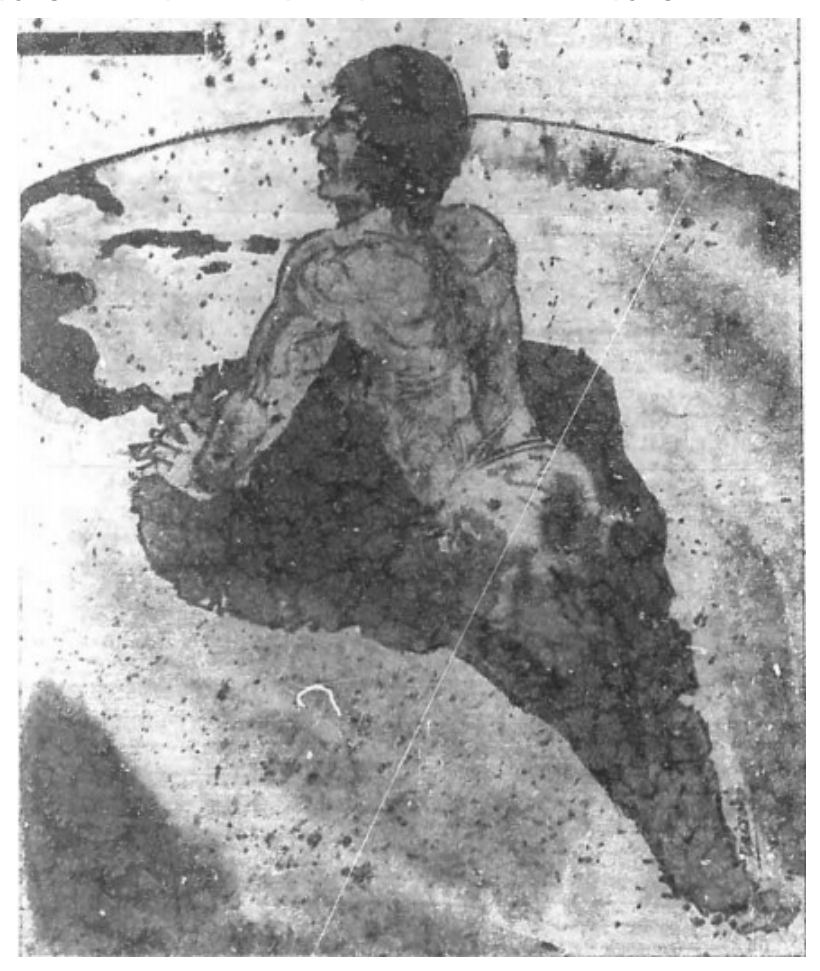
Figure 1. Jose Martí essay illustration (Source: DLOC, taken from Bohemia , 28 May 1965, p. 91; © Biblioteca Nacional de Cuba. Permission granted to University of Florida to digitize and display this item for non-profit research and educational purposes. Any reuse of this item in excess of fair use or other copyright exemptions requires permission of the copyright holder).