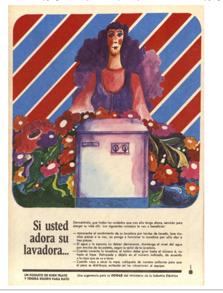
Figure 4. Ministerio de la Industria Eléctrica advert (Source: DLOC, taken from Bohemia , 25 January 1980, p. 2; © Biblioteca Nacional de Cuba. Permission granted to University of Florida to digitize and display this item for non-profit research and educational purposes. Any reuse of this item in excess of fair use or other copyright exemptions requires permission of the copyright holder).

as maternal. For example, a report on a new municipal health centre in Guantanamo highlighted unprecedented maternity care to convey a rural population which 'hoy cuenta con un eficiente servicio de salud pública'.<sup>110</sup> The provision of maternal health care equalised health outcomes between the urban and rural areas. Moreover, it provided legitimacy both nationally and domestically.<sup>111</sup> Cuba's health care system began to garner an international impression during the 1970s, and as with medical missions, the communication of these advancements through gender functioned to benefit the revolutionary state.<sup>112</sup>