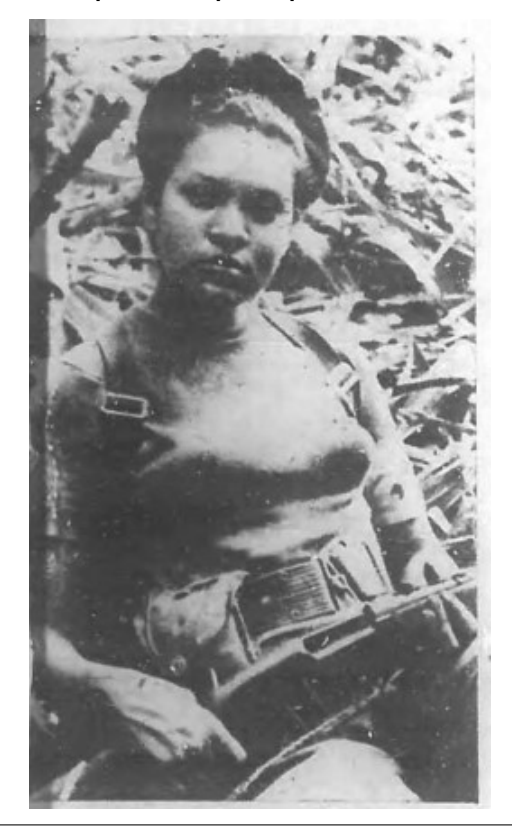
Figure 2. Venezuelan guerrilla photograph (Source: DLOC, taken from Bohemia , 28 January 1966, p. 37; © Biblioteca Nacional de Cuba. Permission granted to University of Florida to digitize and display this item for non-profit research and educational purposes. Any reuse of this item in excess of fair use or other copyright exemptions requires permission of the copyright holder).

Bohemia also offers another, seemingly paradoxical, feminine construction of national identity: armed female resistance. Latin American women frequently appear holding guns, as in one image (Figure 2) of 'la mujer venezolana', participating 'por la liberación nacional, como en Cuba'.<sup>72</sup> The magazine also provides similar images of female guerrillas in Vietnam.<sup>73</sup> In her analysis of the insurrection, Bayard de Volo characterises the 'even the women' narrative, framing women's actions as heroic, transcending 'normal' roles under dire circumstances.<sup>74</sup> Feminised anti-imperialism is striking compared to the absence of this in a Cuban context. As explored, outside tokenistic examples, militarised defence tends to masculine imagery. When depicted, the experience of women in relation to traditional gender stereotypes simultaneously delegitimises the United States and reaffirms this gender ideology.