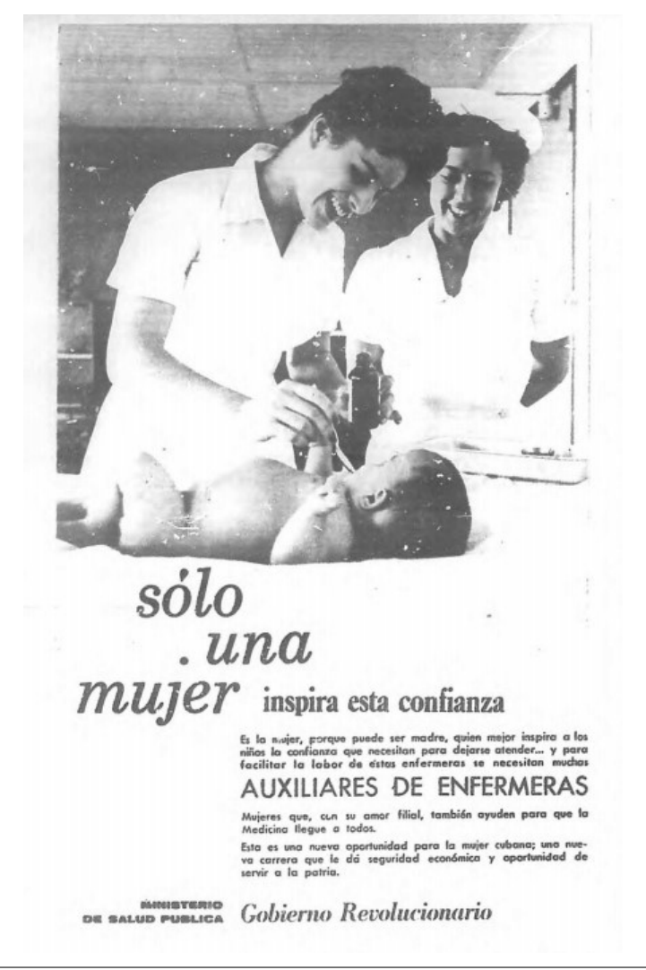
Figure 9. MINSAP nursing advert (Source: DLOC, taken from Bohemia , 22 January 1961, p. 88; © Biblioteca Nacional de Cuba. Permission granted to University of Florida to digitize and display this item for non-profit research and educational purposes. Any reuse of this item in excess of fair use or other copyright exemptions requires permission of the copyright holder).

The coverage in Bohemia also suggests a further reason for the failure of the Code: the revolutionary government's continued focus, indeed reliance, on the construction of the Cuban woman as mother and housewife. While the magazine's promotion of women in the workplace implies a desire to stimulate economic participation, the advertisement and celebration of women's work is articulated with reference to traditional, feminised attributes. In a 1961 advert (Figure 9) encouraging women to enrol as nurses, the tagline, 'Sólo Una Mujer Inspira Esta Confianza' constructs a link between women's medical participation and the presumption of innately maternal attributes.<sup>158</sup> Similarly, in a 1964 article on female reporters in Cuba, below a picture of a woman playing with a child the caption reads: 'Mirta Rodriguez Calderón estaba aquí en función de periodista, pero la curiosidad de la repórter cede ante la ternura de mujer'.<sup>159</sup> Moreover, the article recounts how the interviewees 'se pasmaban ante la hermose e inteligente periodista cubana'.<sup>160</sup> The economic involvement of women is thus reduced to the value of maternity and beauty, demonstrating a fundamental dissonance between work as women's liberator and the pursuit of feminised labour.