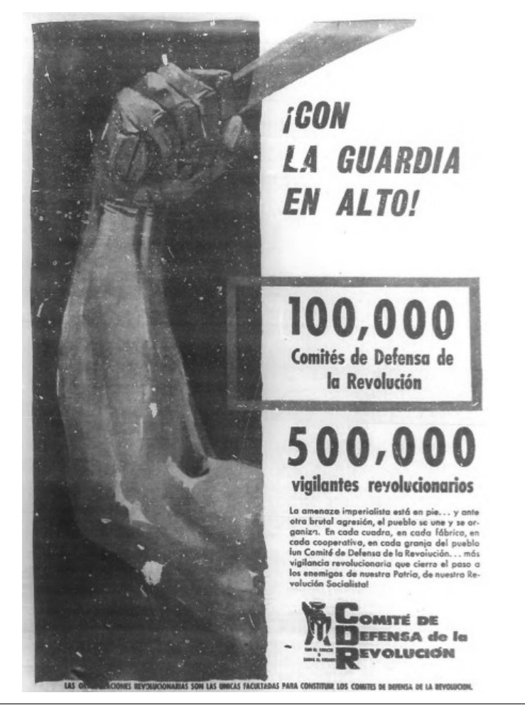
Figure 10. CDR advert (Source: DLOC, taken from Bohemia , 28 May 1961, p. 109; © Biblioteca Nacional de Cuba. Permission granted to University of Florida to digitize and display this item for non-profit research and educational purposes. Any reuse of this item in excess of fair use or other copyright exemptions requires permission of the copyright holder).

of women's liberation; as communicated in a 1977 article on Cuba's economic development, 'te lo prometió Martí, y Fidel te lo cumplió'.<sup>194</sup>