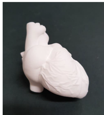
FIGURE 1 Image of the 3D printed heart anatomy model [Color figure can be viewed at wileyonlinelibrary.com ]