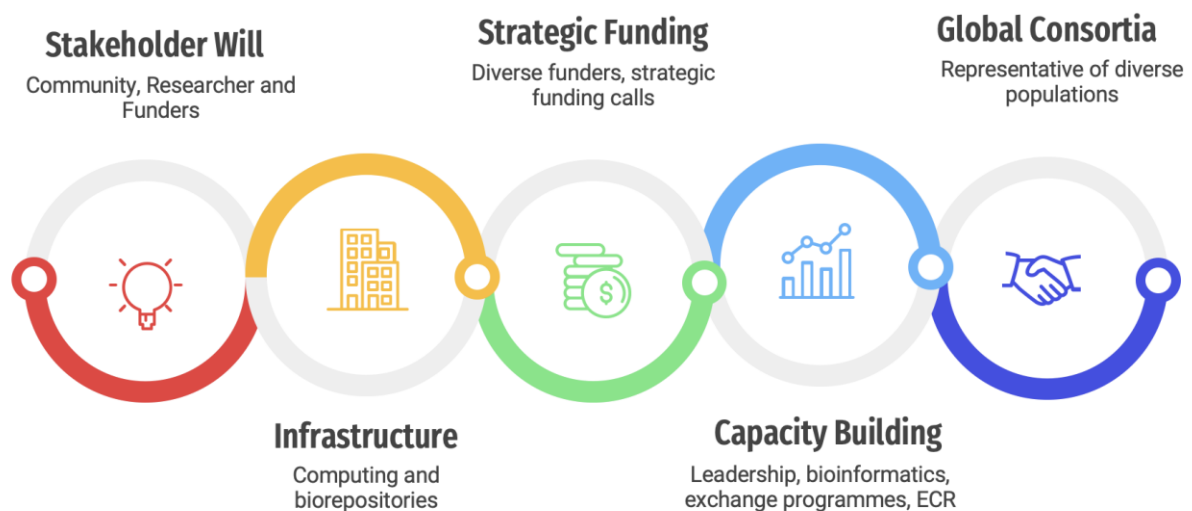
Figure 3: Roadmap showing the key pillars for setting up and sustaining diverse global genomic studies.