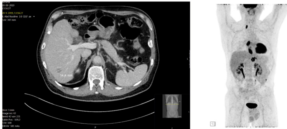
Fig. 2. Follow-up information of real-life clinical case #3 included in this survey.

was university medical center in 79%, comprehensive cancer center in 15%, and community medical center in 6%. Centers were generally high-volume (i.e. 91% of centers performed >30 oesophagectomies or gastrectomies per year). Besides a medical oncologist, surgical oncologist, and radiation oncologist, the following specialities were present at the MDT meetings: a radiologist in 60%, a gastroenterologist in 49%, a pathologist in 40%, and a nuclear medicine physician in 28%. Table 2 shows the characteristics of the participating MDTs.