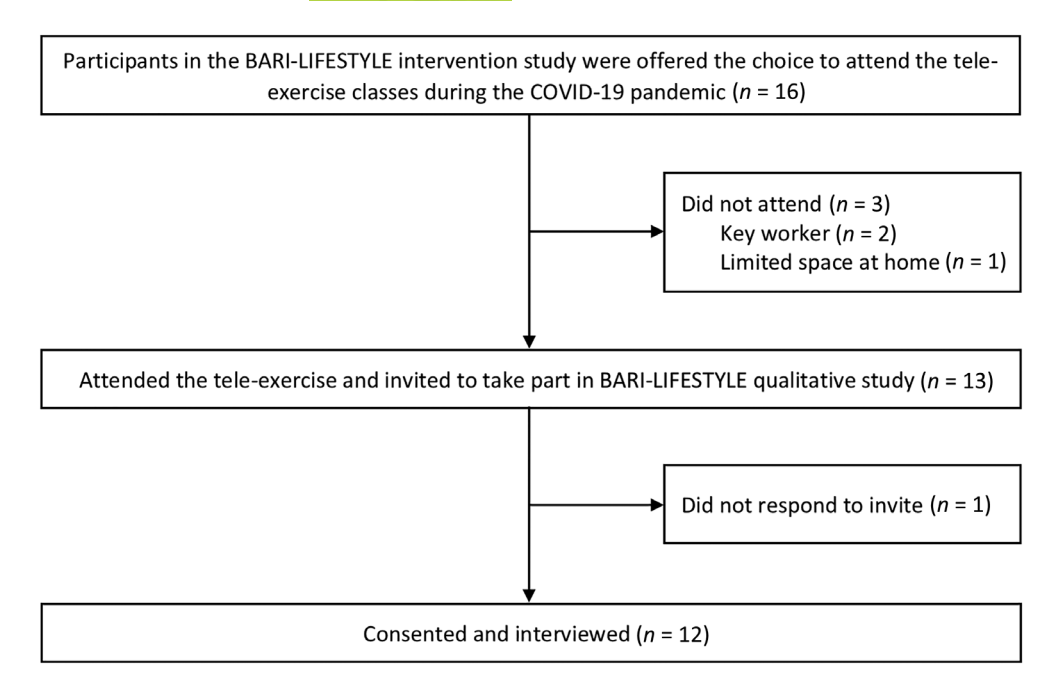
FIGURE 2 Participant flow diagram