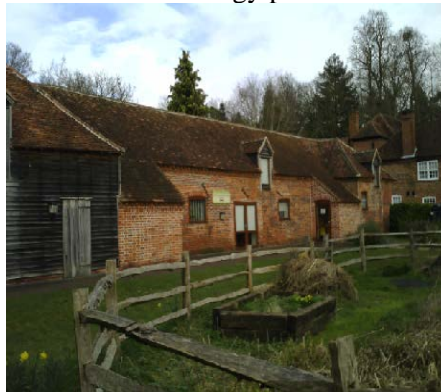
Figure 1. External view of the education centre.

An education centre located in Berkshire (UK) and surveyed by the authors was used as case study in this project (figure 1). The building was constructed in the 1700s and was originally a barn. However, in 2011 it was converted into an education centre considering a low-energy, low-carbon retrofit strategy. As a result, the building envelope as well as its energy performance improved significantly.