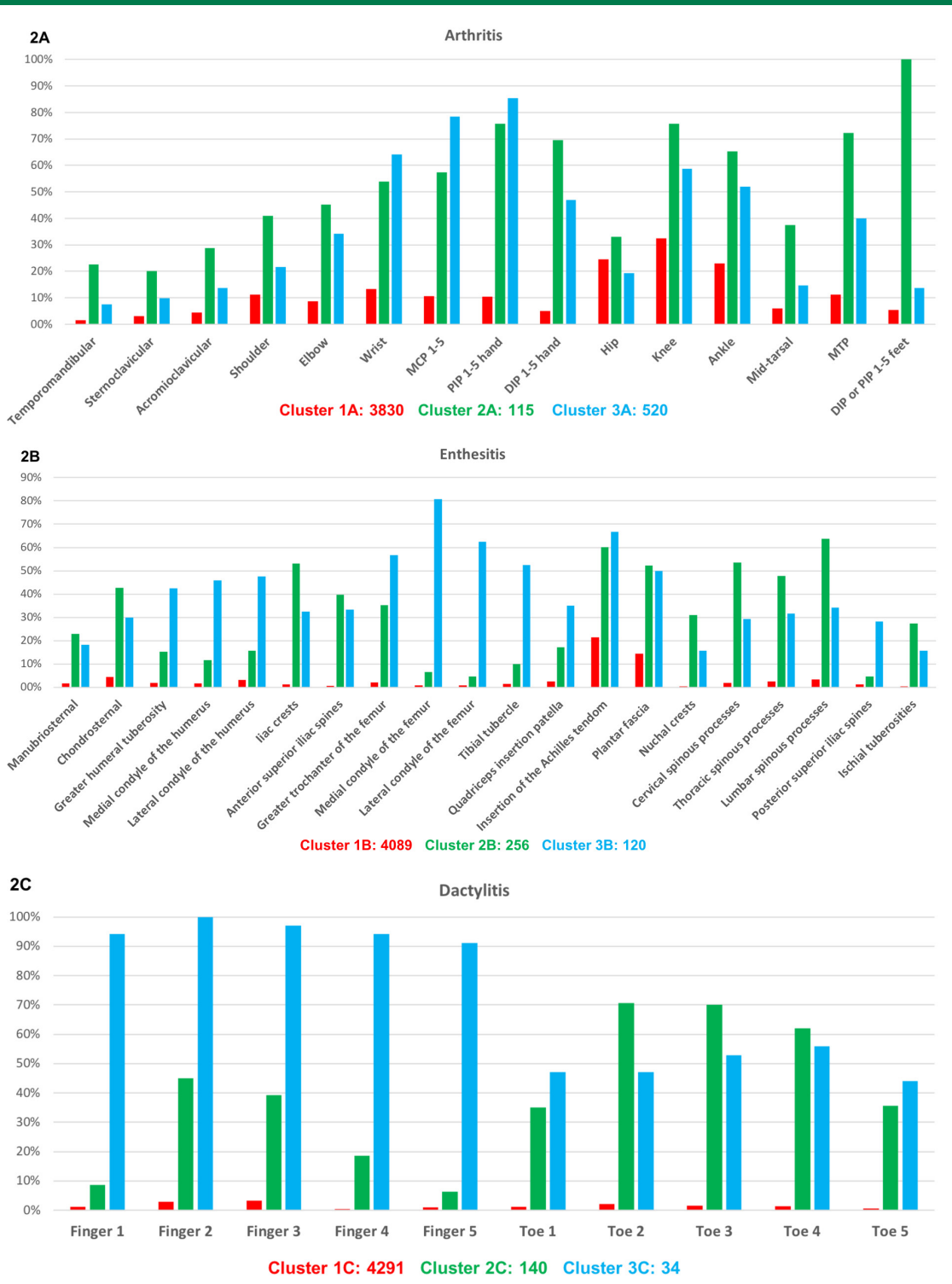
Figure 2 Distribution of the location of peripheral involvement across clusters with regard to the arthritis (A), enthesitis (B) and dactylitis (C). DIP, distal interphalangeal joint; PIP, proximal interphalangeal joint; MTP, metatarsophalangeal; MCP, metacarpophalangeal.

256 and 120 patients, respectively). Cluster 1B showed a very low prevalence of enthesitis (figure 2B) but, if present, they were more frequently located at the Achilles tendon and plantar fascia (ie, heel enthesitis). Clusters 2B and 3B showed a high prevalence of enthesitis, with a predominant involvement of axial locations in cluster 2B and peripheral locations in cluster 3B.