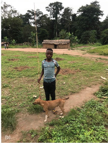
Figure 1. Children hunt rats with expedient spears as part of work play (a), and an adolescent prepares to go spear hunting with his dog (b).

categorized as adults (n=3), and young adults (20 years) who were not married (n=2) were categorized as adolescents. One adult declined to participate, stating that he was preoccupied with other work activities. In total, 24 adolescents (mean age [m_{\rm age}]=15.79 years; range, 12–20 years) and 47 adults ( m_{\rm age}=37.06 years; range, 17–70 years) participated in the research.