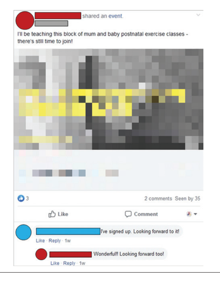
Figure 1: Sample (anonymized) interaction between a local business and a local parent taken from the ABC Lab Communities page

The second area of need was for pregnant women and parents of young infants. While the town benefited from a number of popular playgroups and activities for young children, these were less suited to smaller babies. The generally high level of noise, and fear of boisterous toddlers trampling on infants, put off parents of babies who were unable to sit unsupported or crawl. Additionally, local parents informed us