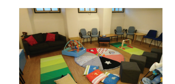
Figure 2: Set-up of lab space for the Baby Bee sessions

At a distance from the mats, tea, coffee and snacks (provided by the university) were available. At the beginning of each session, mothers entered the space, took any refreshments they wanted, and sat around the room. The first twenty minutes of every session were given to informal peer interaction. Members of the lab team who were themselves experienced mothers sat with the mothers in attendance, interacting