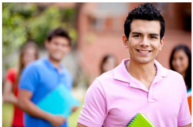
Figure 6.1 Stock Representations of Students