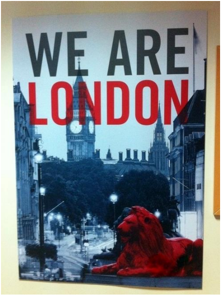
Left: Union Jack-themed car outside UNE campus entrance; Right: London imagery-themed signboard displayed in GLU campus corridor

While each institution drew upon various discourses of the UAE higher education marketplace – quality, value, universality, globality, and others – to different degrees, they were similarly tinted with UK references which collectively spoke to a British national brand. This section identifies and analyzes references to the UK in relation to the functions and meanings of marketing images and texts, looking at how various discursive features of campuses and their degrees are qualified through a British lens. It uses the term discourse to refer to the educational objects that are socially constructed through communicative practices in the UAE, such as quality or recognition. These are considered discourses as