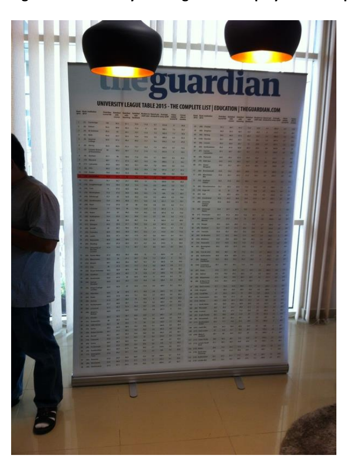
Figure 6.3 A UK-only Rankings Table Displayed at an Open Campus Event

From ASU open day event (taken by researcher in March 2015).