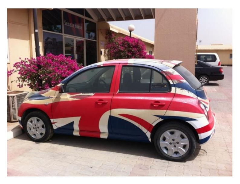
Figure 6.2 Nation Branding on Campus

however, these images also provide an opportunity to analyze the UK as a collective brand of higher education, discursively constructed through its visual and textual deployment. In this regard, the overt representations, as well as the more casual references to the UK, can be analytically revealing where identified in proximity to other discourses or selling points. With a deeper interrogation of not only the frequency and proximity between these discourses, but what they speak to and where they manifest, it is possible to reconstruct the UK national brand through its discursive marketing formations.