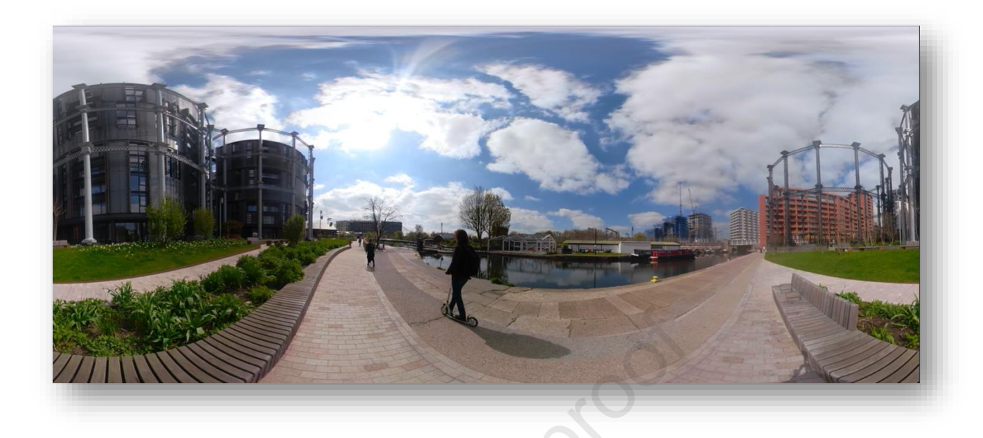
Figure D1c shows Pancras Lock in London represents an acoustic environment with a mix of

natural and unnatural environmental sound