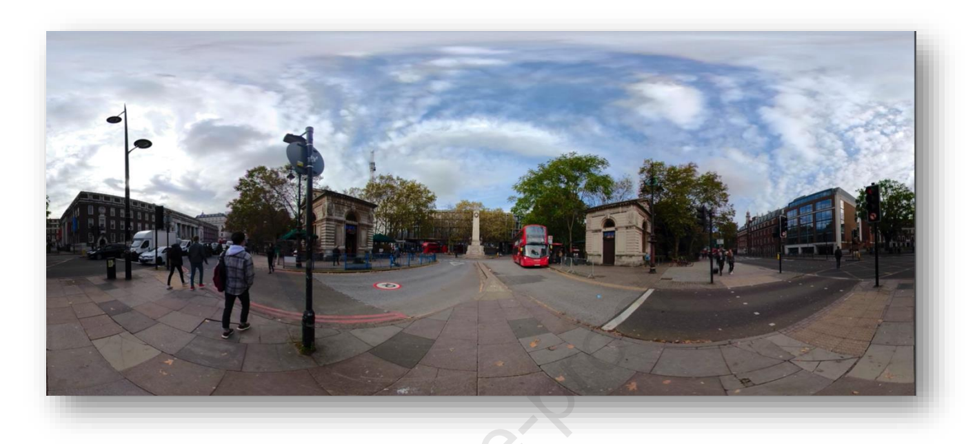
Figure D1a shows Euston Tap in London represents an acoustic environment dominated by