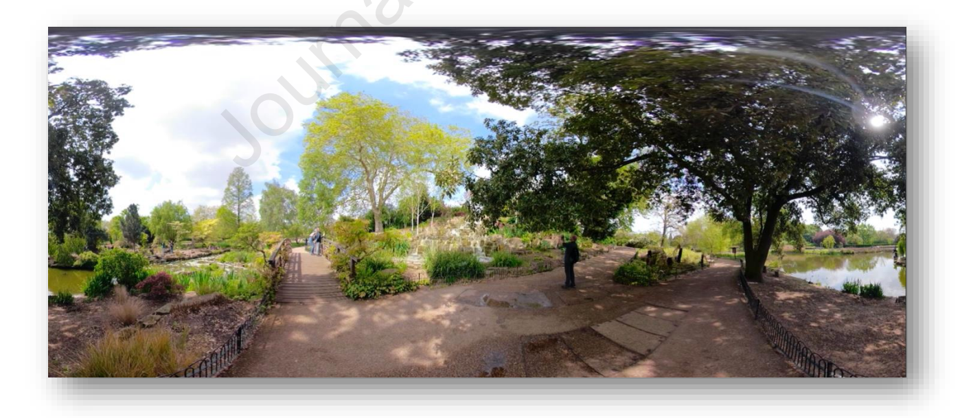
Figure D1b shows Regents Park Japan in London represents an acoustic environment with natural environmental sound