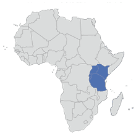
(e) East African Community