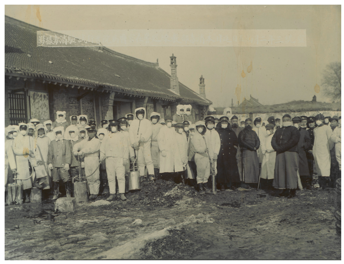
Figure 2 A disinfection squad wearing masks at Changchun plague hospital during the first pneumonic plague epidemic in Changchun, Manchuria in 1911.

Several studies described how the visual properties of masks played a key role in their ability to generate solidarity. The uniformity of mask shapes and designs commonly used by the public made them a powerful visual tool to materialise 'sameness' and unity. Anthropologist and historian Lynteris described this property while examining the early uses of face masks as a technology of containment during the 1910-1 plague outbreak in Manchuria.<sup>32</sup> Dr Wu Liande, credited as the inventor of the 20th century face mask, created a photographic album of his efforts during the plague. It contained 47 photographs of humans, 32 of them masked men. The photographs created a powerful 'spectacle of masked unity' that reverberated across the scientific world (figure 2). Baehr also observed the visual properties of photographs with large numbers of masked persons as a means to communicate social 'sameness' and solidarity in the context of the 2003 SARS epidemic in Hong Kong: 'By blurring social distinctions, it (the mask) produced social resemblance. Mask-wearing activated and reactivated