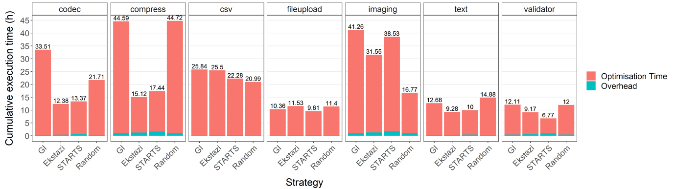
Fig. 2. RQ2. Cumulative execution times Results are for four GI strategies i) without RTS, ii) and iii) with RTS, and iv) GI with random test selection.

is statistically significant in 86% of the cases and large in 71% of the cases. Furthermore, when considering the cumulative total cost of experimentation, using RTS can save more than a third of the execution time.