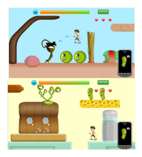
Figure 3 - Bugs are shown in different locations – on the skin and in the kitchen

The third section of the game seeks to demonstrate the usefulness of some microbes. The player has to push lactobacillus microbes into glasses of milk in order to turn the milk into yoghurt; as illustrated in Figure 4.