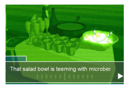
Figure 8 - Microvision of the barbecue scene – microbes visible in the salad bowl

resistance. For better illustration of the PBL concept we present an example from the first puzzle. A famous actor gets sick by infection transmitted as a result of poor hygiene at a bathroom but poisoning food and insufficient hygiene in the kitchen must be eliminated by collecting and testing evidence samples. Figure 8 illustrates so called "micro-vision" feature allowing users to see microbes on the scene, collect samples and test them.