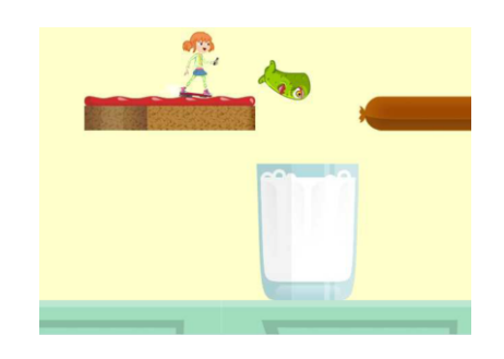
Figure 4 - Player transports lactobacillus to make yogurt

The third section of the game seeks to demonstrate the usefulness of some microbes. The player has to push lactobacillus microbes into glasses of milk in order to turn the milk into yoghurt; as illustrated in Figure 4.