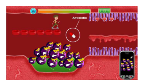
Figure 6 - Player delivers full course of antibiotics to infection

The final section tackles appropriate antibiotic use. Seeking to show that antibiotics kill good and bad bacteria but no viruses, we implemented a 'smart bomb' effect for antibiotics. To show the importance of finishing a full course of antibiotics, the player is shown an infection grow back after initially appearing dead following a partial antibiotic course. By using the remainder of the course, the infection is fully eliminated. This level is illustrated in Figure 6.