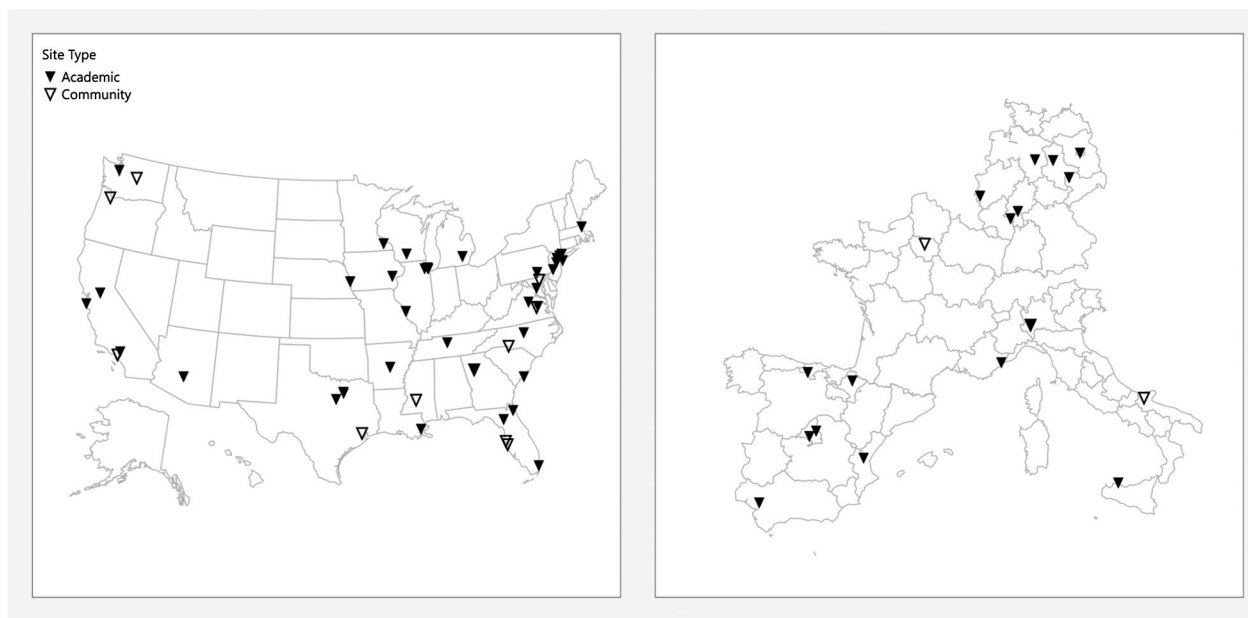
FIG. 1. TARGET-HCC sites in the United States and Europe. Maps illustrating the location of sites in the United States and Europe participating in TARGET-HCC; 84% of sites are located in the academic setting, 16% of sites are located in the community setting.

TARGET-HCC is an ongoing, longitudinal, observational cohort of patients receiving medical care for HCC in usual clinical practice across both academic institutions and community practice sites in both the United States and Europe (Fig. 1). The primary aims of TARGET-HCC are to define the natural history of HCC and to estimate the association between therapeutic interventions for HCC and subsequent health outcomes in a real-world setting. Secondary aims include i) evaluation of the impact of HCC treatment interventions and concomitant medications on comorbid conditions and liver function and patient-reported outcome (PRO) measures during the natural course of HCC and management with health-related quality of life questionnaires and ii) establishing a Biorepository Specimen Bank. Exploratory aims include investigation of optimal type, duration, and sequence/combination of treatment interventions for HCC used in