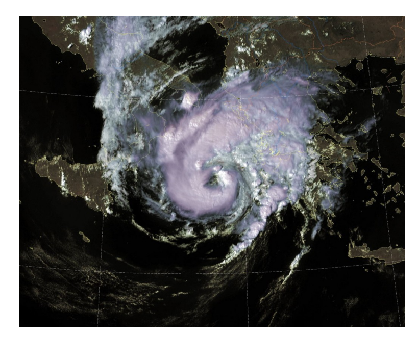
Figure 1: A VIIRS (Visible Infrared Imaging Radiometer Suite, on board Suomi NPP) image of Medicane ' Ianos ' at 13 UTC on 17 September 2020. Note the spiralling bands of convection surrounding the eye-like feature east of Sicily. The cirrus outflow from this convection merges to form a canopy south and west of the storm centre.

Spotlight: Medicane 'Ianos' over the central Mediterranean 14-20 September 2020