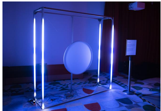
Figure 1: The Light by Friendred. Exhibition held at Tate Britain / Late at Tate