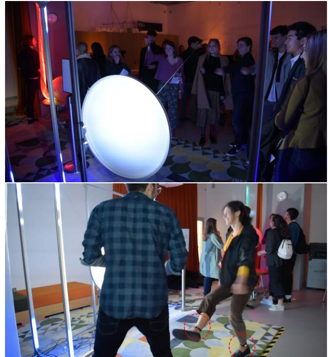
Figure 2 (a): In this image, a group of users wore four devices simultaneously, and were trying to synchronize with one another. (b) Here one user wore two devices on her feet (marked by red circles), while interacting with another user, who was holding a device.

Five wristbands with wireless, IMU-based motion sensors were provided for participants. As shown in Figure 2, individuals, or groups of two or more people, could wear one or more sensors. The sensors controlled different lighting patterns on the installation. The interaction was designed to be MQ based. Multiple free-form gestural inputs, such as shifting position, fast and slow movements, and changes in rhythm, led to dynamic lighting effects. Users' behaviors were implicitly connected to the