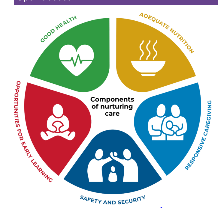
Figure 1 The components of nurturing care.<sup>3</sup>

than extended families are the norm, and fewer older siblings are available to look after younger siblings due to welcome gains in school enrolment. These changes drive demand for paid childcare,<sup>67</sup> the quality of which is likely to impact on early child development.