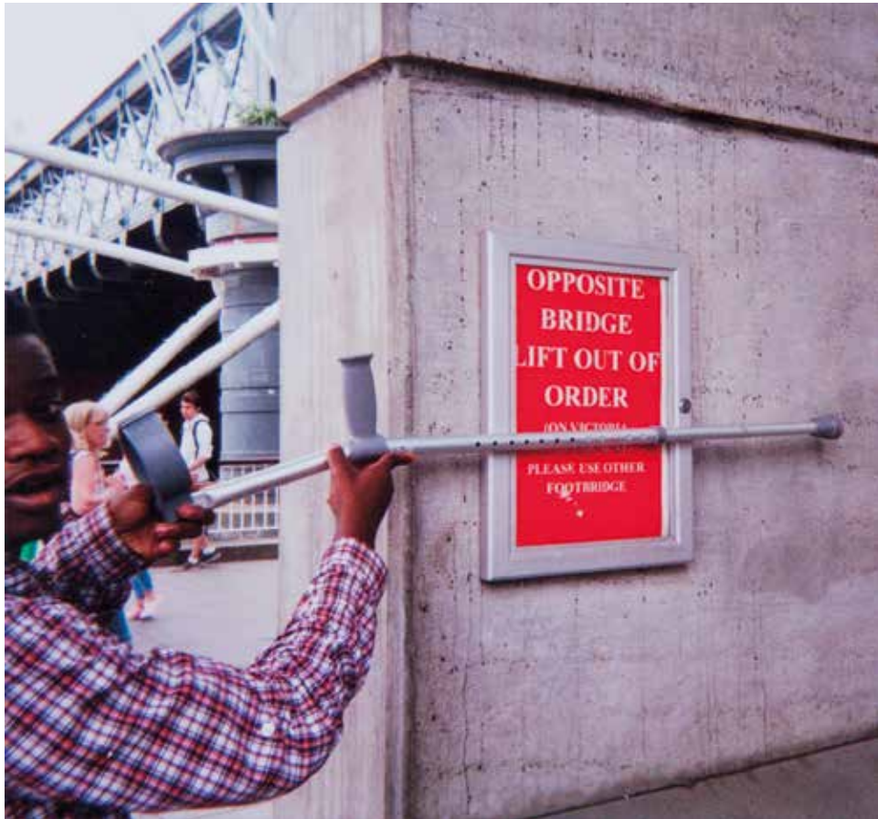
Lift out of order , Brighter Futures Group