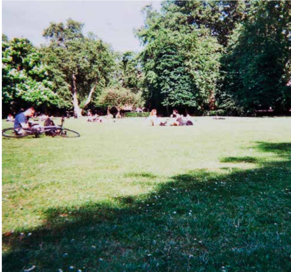
Life , Brighter Futures Group

Bicycles roll by People searching For their goals, dreams and life No matter the rain drops Still keep riding. Loneliness is hidden in their eyes.