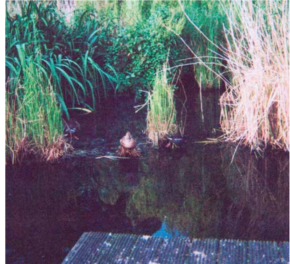
At peace , Brighter Futures Group

Relaxation. Happiness. At peace. Lord is for everyone.