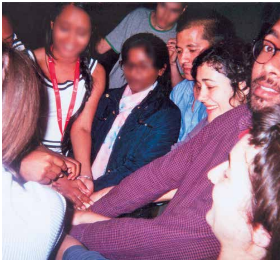
Happy , Brighter Futures Group