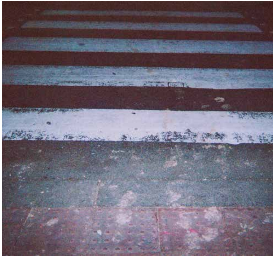
Hope , Brighter Futures Group