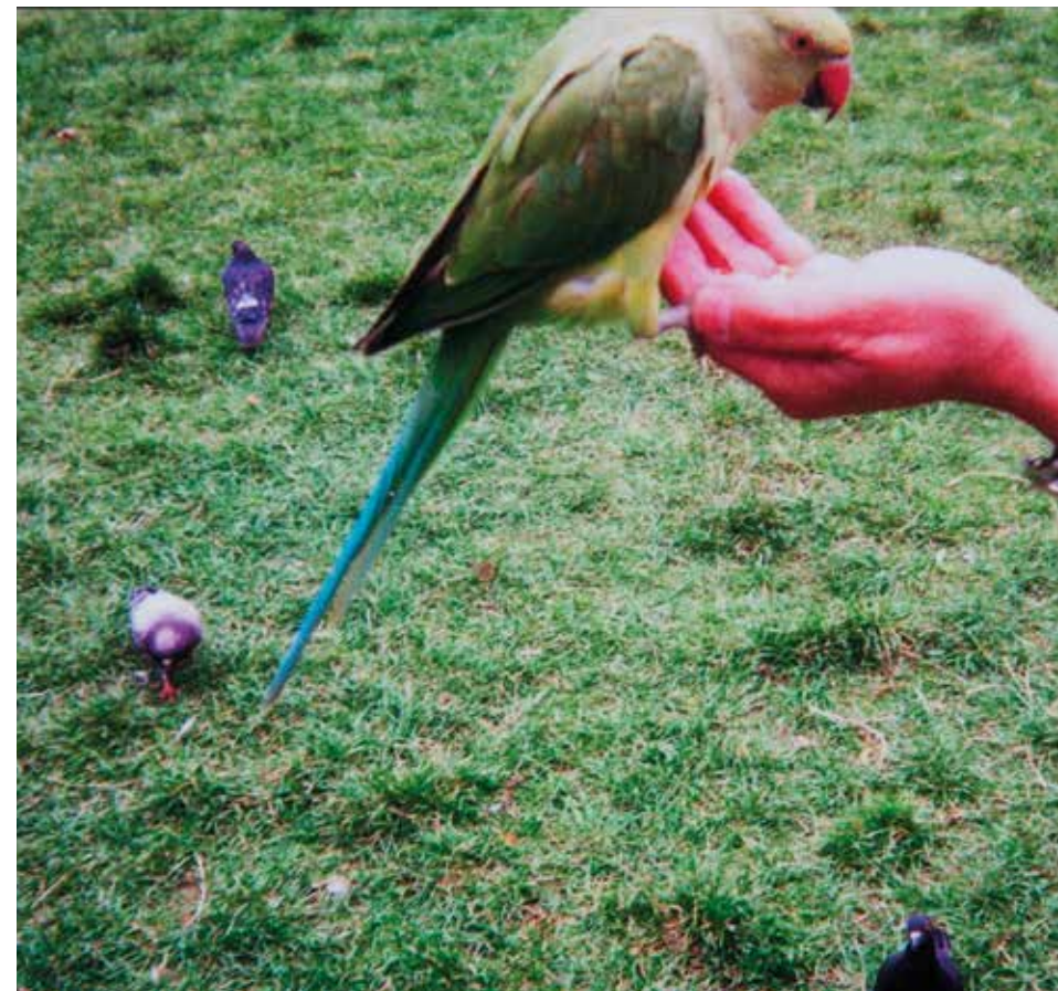
Trust , Brighter Futures Group

A bird, Paddington station, at 3pm Loneliness everywhere Searching for help. Just because we lost our happiness The trees were laughing at her. Air was giving sympathy The sky was looking at her Roads giving place to relax herself. Nature makes her feel good She hopes one day she will fly again.