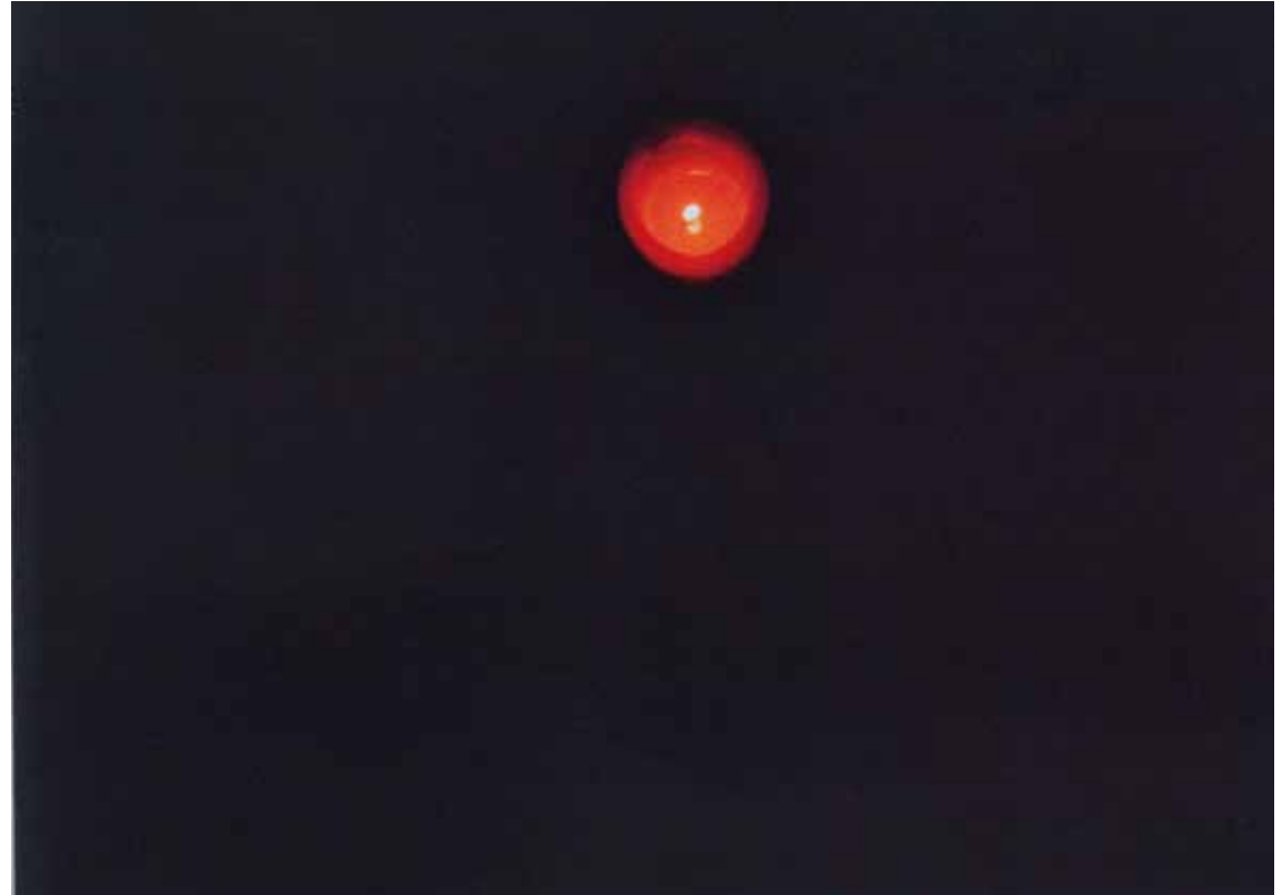
Dark , Brighter Futures Group

Enlightenment could overcome the darkness.