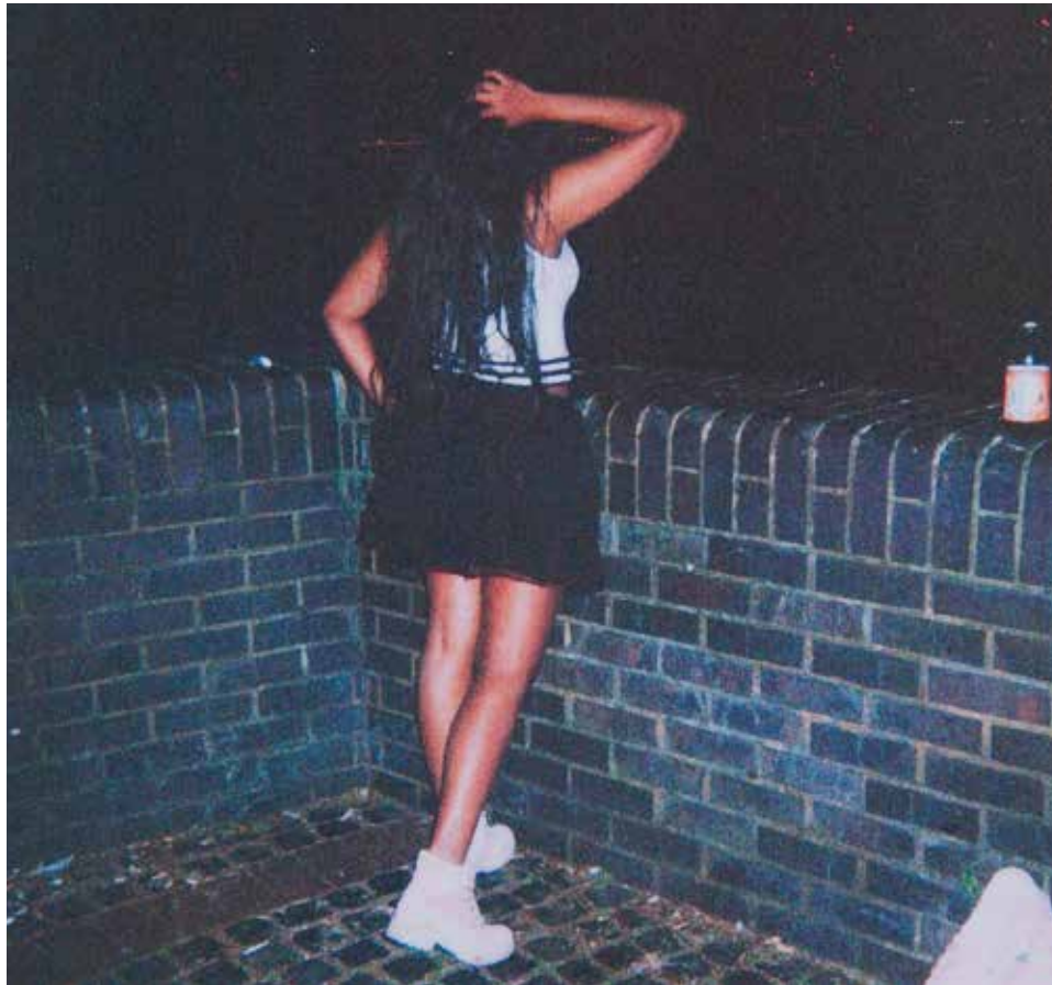
Freedom , Brighter Futures Group

When things become difficult, try to get away. Try to be free and to unload all your burdens.