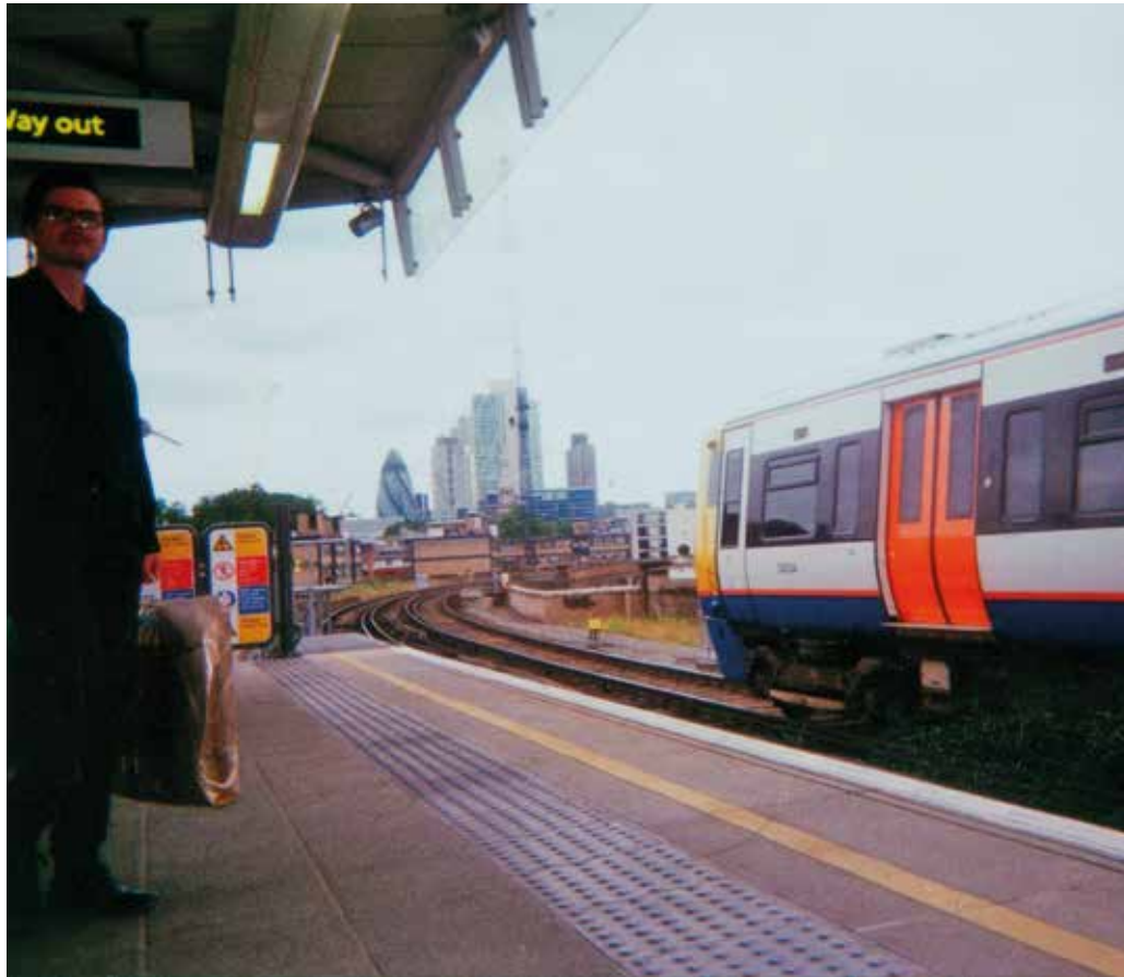
Waiting , Brighter Futures Group