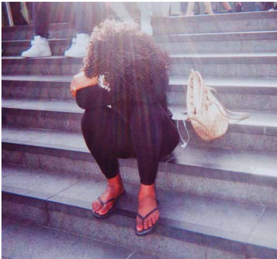
Sad and alone

She is thinking how to solve her problems. It can be difficult to climb the steps but never lose your hopes. Our journey starts together. For us, to start this journey we have to decide what we want in life.