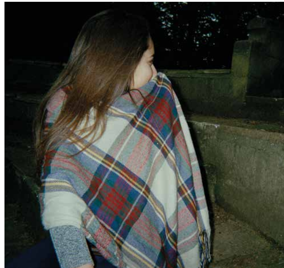
The girl and the blanket , Bes

In this lonely world the only support you've got left is your blanket. It's the only thing that holds you in your hardest times, when you want to cry, when you want to shout, when you feel alone and, most importantly, when you feel cold. The blanket is the only thing that gives you the warmth of home.