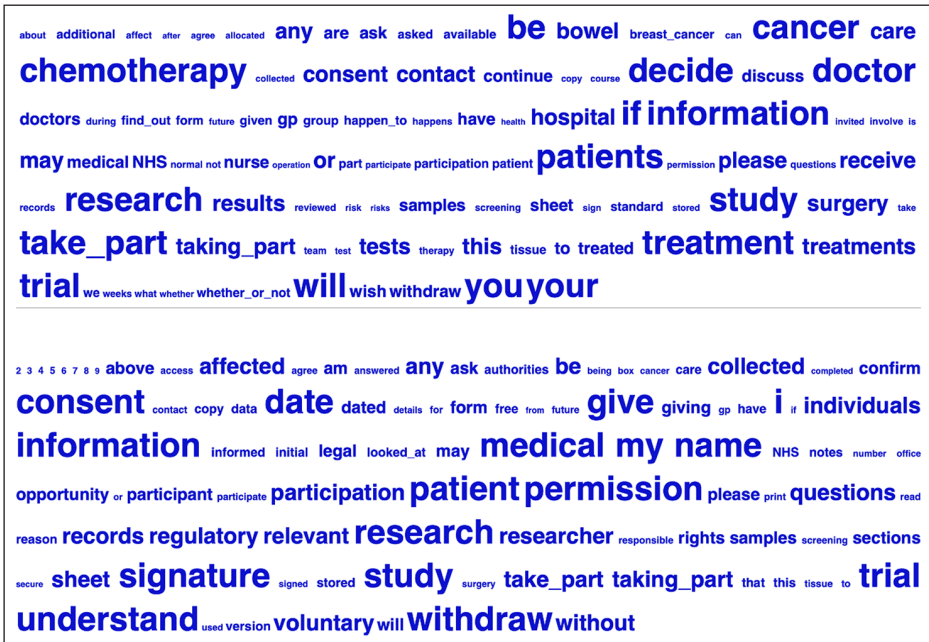
Figure 2. Keyword cloud from PIS corpus (above) and CF corpus (below).

uncertainty or condition in the PIS keyword cloud, ‘consent’, ‘permission’, ‘confirm’ and ‘understand’ in the CF keyword cloud imply affirmation.