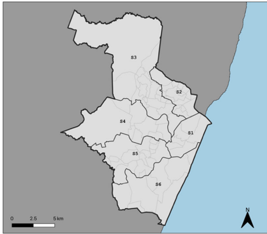
Figure 1: The study area of Recife. It consists of 6 health units, wherein, the health units are further sub-divided into 72 neighbourhoods.

that form the region of Recife. The geographical area lies between latitudes -8.17 & -7.90 (South) and longitudes -35.05 & -34.85 (West). As shown in figure 1, the area has been delineated into six major health zones for which, each health zone is subdivided into 72 lower health neighbourhoods. This research uses ecological study design for the analysis of spatiotemporal data since we are using aggregated surveillance and climate data that is month-specific, as well as the neighbourhoods being spatial areal units. The reader should bear in mind that the analysis was limited to periods between January 2010 and July 2014, inclusive, as there were no open source weather data available from August 2014 and onwards. In addition, surveillance data from August 2014 were incomplete.