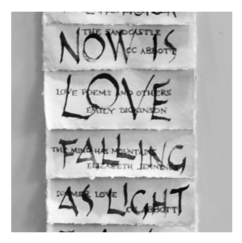
Figure 5 Dedication , artist's book by Liz Mathews (detail).

Ackland had believed, during her miserable childhood, that she 'had the poets to protect me' and that they remained her 'friends and protectors'. <sup>13</sup> (A poetry library might represent to her the ultimate company of poets, ever-ready to defend one of their number.) These poets' books were perhaps so potent to her because their authors proved