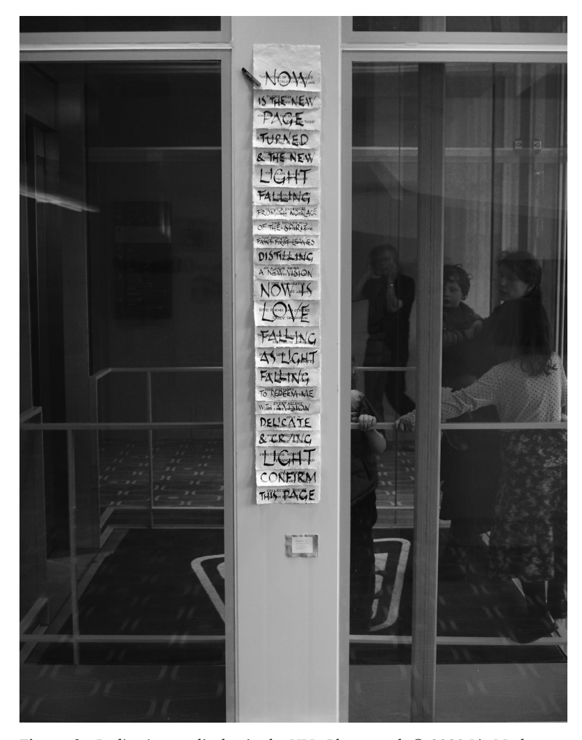
Figure 6 Dedication on display in the NPL.

Sylvia Townsend Warner's book-list for the Ackland Bequest enjoys a further presence in the National Poetry Library, as the basis of Dedication , an artist's book by Liz Mathews which was recently acquired by the library. Titles from the bequest are lettered in charcoal on a waterfall of pages on handmade cotton rag paper, with text from the poem by Lilian Bowes Lyon (lettered in ink with a