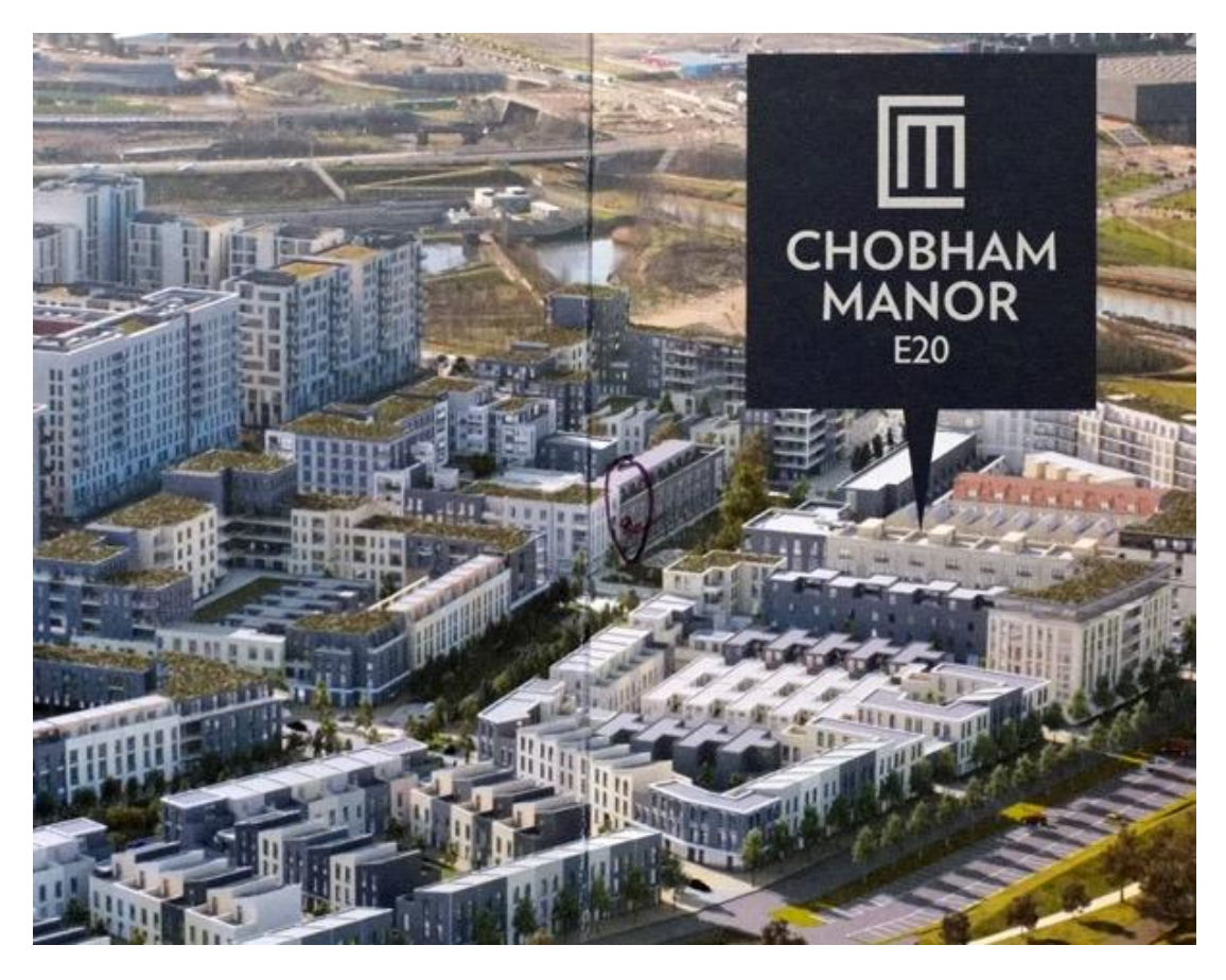
Figure 2. Biro dot indicating The Moselle townhouse in the Chobham Manor brochure.