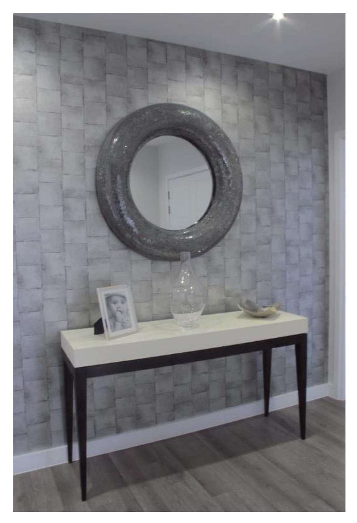
Figure 3. Entrance hall in one of the show apartments at Chobham Manor in 2016.