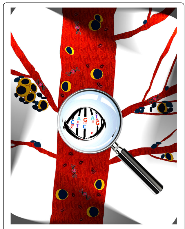
Fig. 2 Is there utility for CRISPR via circulating tumour DNA detection?

Our desire to achieve a greater understanding of the genome in the past 3 decades has been the main driver of technological development in this area. Now that we