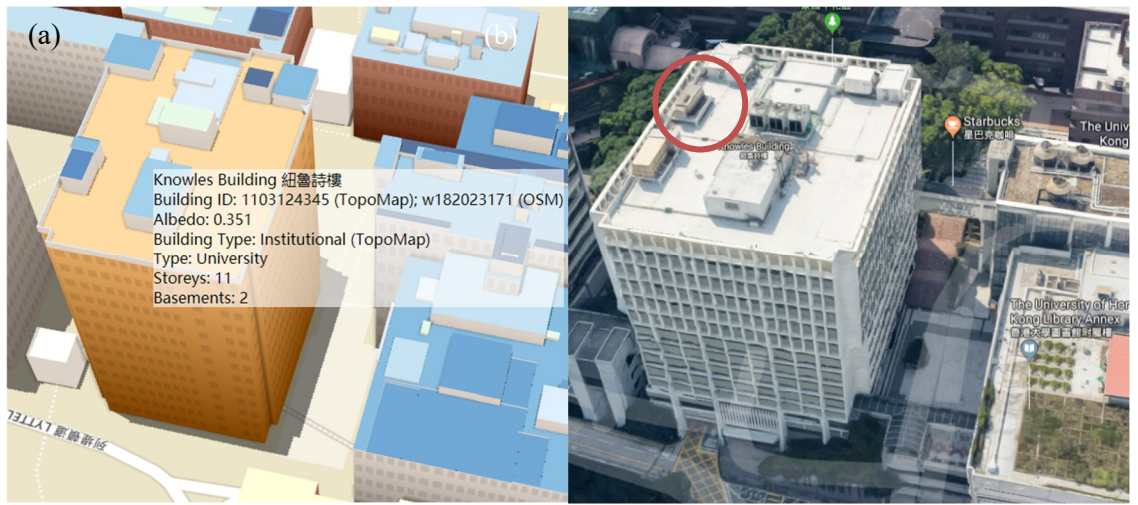
Figure 4. Example of the output model. (a) Roof and rooftop elements of Knowles Building, HKU (cooler color indicates higher albedo), (b) the referential 3D building model in Google Earth, where the circled is a missing element in (a).