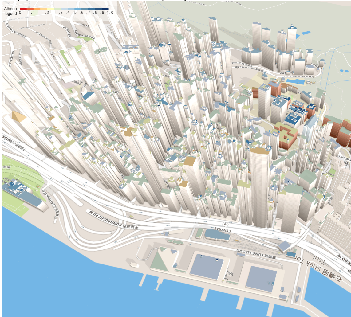
Figure 3. Screenshot of the LiDAR-based albedo models of roofs and rooftop elements visualization (cooler color indicates higher albedo).

Beside of the albedo, each roof model was also associated with the topographical map of Hong Kong (in HKGS1980 coordinate system) and Open Street Map (in WGS1984). As a result, more semantic properties can be enriched to the model of the building. Figure 4 shows the Knowles Building, HKU, in which the offices of the authors reside, in the web visualization system. Apart from the geometric dimensions, one can read the more properties from the mouse tooltip (Figure 4.a): Name, building IDs in the topographic map and Open Street Map , roof albedo (0.351), type of building, storeys (including the level of basements). In comparison to the model in Google Earth, as shown in Figure 4.b, all rooftop elements including the parapet walls, elevators' machine rooms, water tank, and cooling towers, except for one circled in red. Since the albedo is not available in Google Earth, and the GeoJSON is an open GIS format, the albedo models presented in this paper can facilitate more in sustainability study.