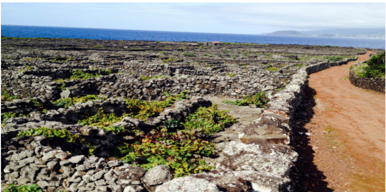
A striking example of humans' ability to make a living in a hostile environment, the Pico vineyards have been vulnerable to cycles of prosperity and failure, transforming the island's economic and social structure since the fifteenth century

The geographic scope of the works reviewed in this book is also wide. Once again, the author knows what he is writing about, being a founding member of the American, European and South Asian Environmental History societies. Refreshingly, there is information about countries that are often ignored in academic reviews because their output is in a language different from the author's own. However, because of this breadth, the text is at times reduced to a tedious listing of authors, books, institutions, societies, journals and conferences, especially in the European section, where it almost becomes a 'who's who' of environmental history rather than a review of theories and methods.