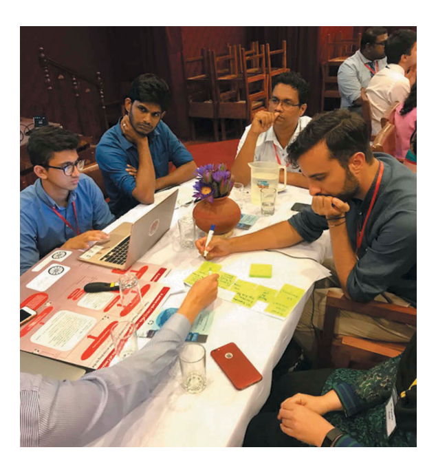
Figure 1. Participants mapping care as expected for acute care using process mapping tools, facilitated by international faculty.

Six project proposals were developed, informed by these evaluations of care, using routine clinical information captured through the NICST platforms while acknowledging limitations in the collection and use of this information [11,16,21,24]. The projects were: optimising sedation in ICU, refining referral of deteriorating patients, reducing surgical site infection after caesarean section, reducing surgical site infection after elective general surgery, improving perioperative pain assessment and improving efficiency in electrocardiogram (ECG) recording and escalation for patients presenting to hospital with symptoms of AMI. These six project proposals for the QI initiatives, alongside ethics applications (if needed), were developed. Where necessary, additional process measures were identified to enable evaluation of the