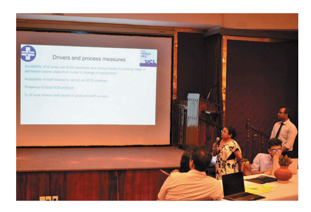
Figure 3. Participants sharing their project proposals with the CQIN workshop.