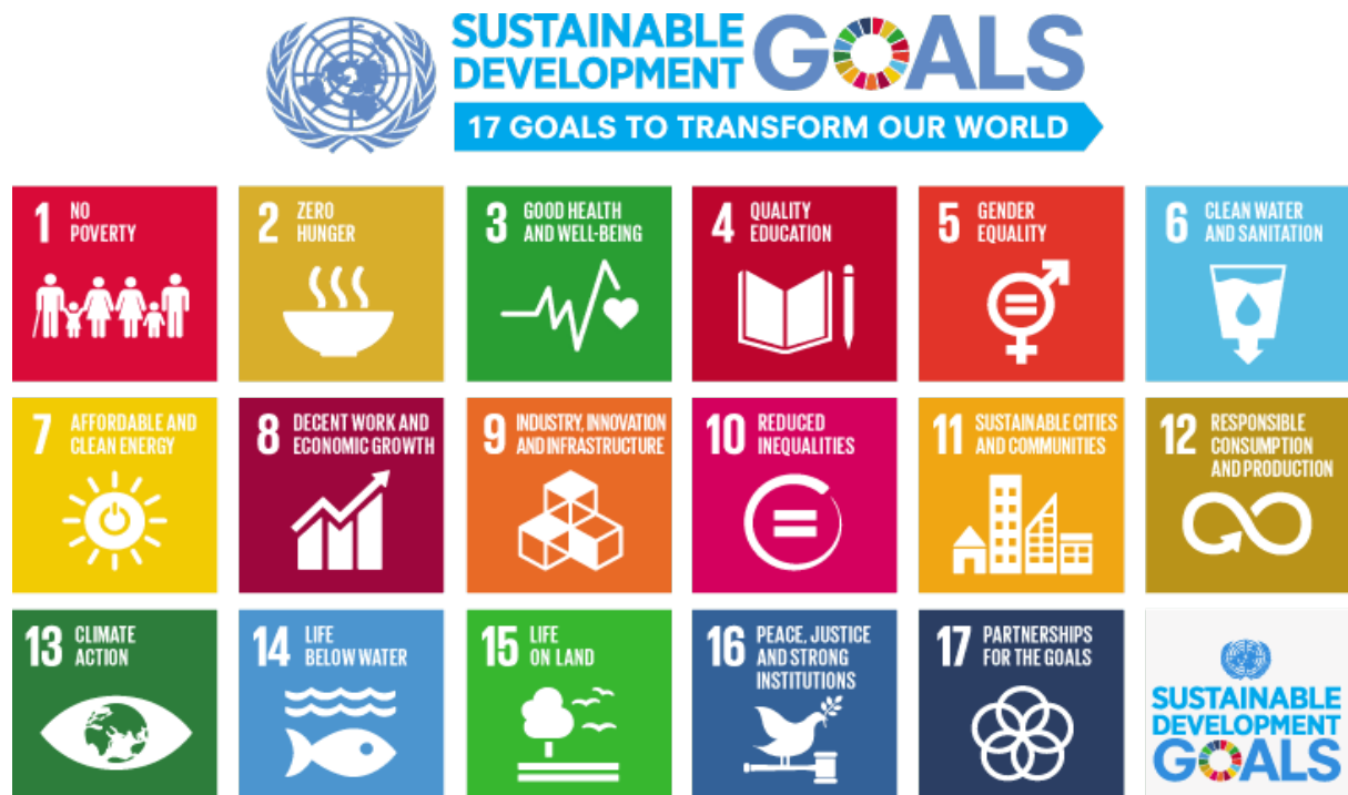
Figure 2: Sustainable Development Goals.

EWB-UK has embraced the UN’s Sustainable Development Goals as core principles guiding its efforts (see Figure 2) and the team will also consider which of the SDGs figure prominently in interview narratives.