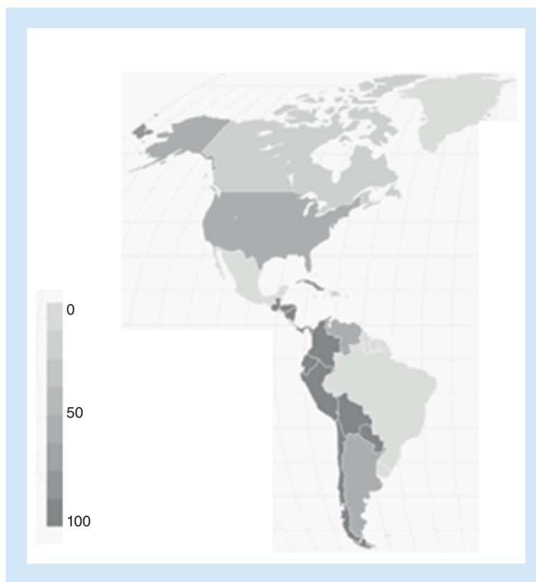
Figure 1. The percentage of Staphylococcus aureus that is methicillin resistant in North and South America. Data taken from [12].

in the EU alone (WHO 2016). The aim of this paper is to review some of the mechanisms microorganisms use to resist antibiotics, and examine molecular mechanisms to target AMR.