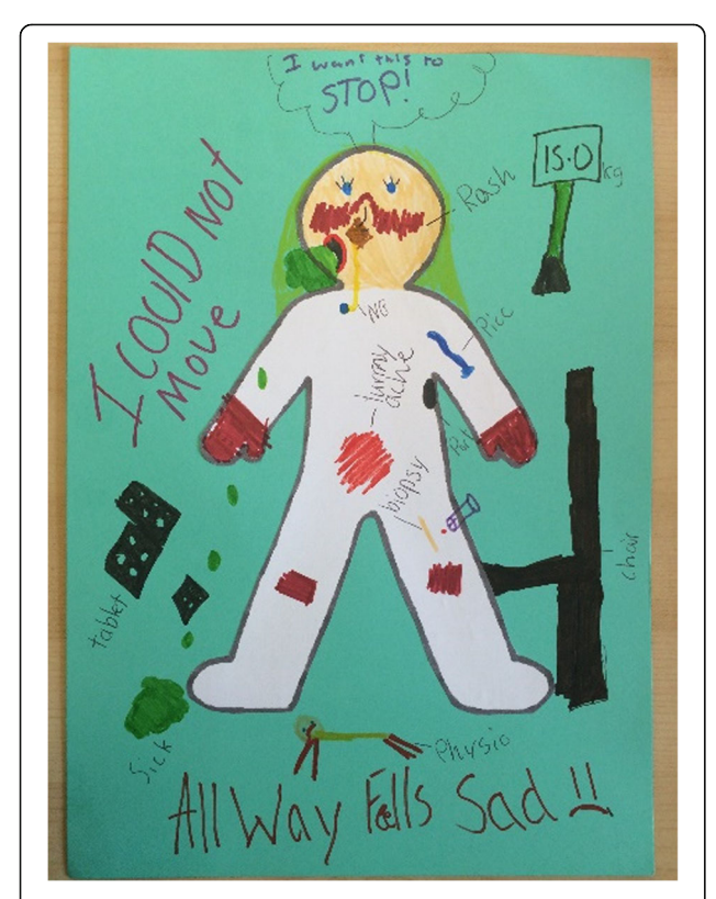
Fig. 1 A drawing representing participant's experience of Juvenile Dermatomyositis. Children and young people were given the option of drawing how they view the effects of Juvenile Dermatomyositis on their body, either as part of the interview (a warm up activity) or if they did not want to talk, instead of the 'standard interview'. They were offered a blank 'bodymap' and encouraged to complete however they wanted to, whether in text or drawing. The young person who completed this example, explained that they were drawing; the rash on the hands and face and knees, the biopsy site, the intravenous line in situ, constant tummy ache, vomit due to the medicines, tablet packets, scales (as they had lost so much weight) and a chair which they required as they couldn't stand. They went on to write on their picture "I could not move", "Always feel sad" and a thought bubble showing "I want this to STOP"

The aim of interpretive phenomenology is to describe, understand and interpret experience from those experiencing it [17, 19, 31], achieved through a circular continuous process of reading, writing and talking [32]. A method proposed to derive narratives from transcripts [33] was modified into clear steps (Table 1). This process begins with the reading and re-reading of the transcripts, before removing repetition and superfluous text. As the