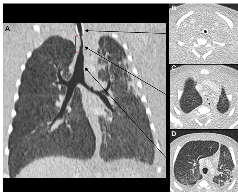
Figure 1 Antemortem CT thorax obtained 1 month prior to death. (A) A coronal 5 mm minimum intensity projection (miniP) image, viewed on lung windows, demonstrates the tight tracheal stenosis immediately distal to the endotracheal tube (red square bracket). Axial CT sections obtained (B) above, (C) at the level of the stenosis and (D) inferior to the stenosis show the relative narrowing of the trachea in relation to the intubated and non-stenosed sections (arrows).

The trachea was prepared using a solution of formalin and potassium iodide, and imaged at a resolution of 28 microns (0.028 mm). This was performed on a Med-X Alpha micro-CT scanner (Nikon Metrology, Tring, UK) with a molybdenum target and no additional filtering. The tube current was 111 microamps, with energy of 90 kV, power of 10 W, gain of 24 dB. The exposure time was 354 ms, comprising 2294 projections, 4 X-ray frames per projection, taking approximately 38 min to acquire. Scans were reconstructed using modified Feldkamp filtered back projection (with median filter kernel size 3) on proprietary software (CTPro3D; Nikon Metrology), and postprocessed using VG Studio MAX (Volume Graphics GmbH, Heidelberg, Germany).