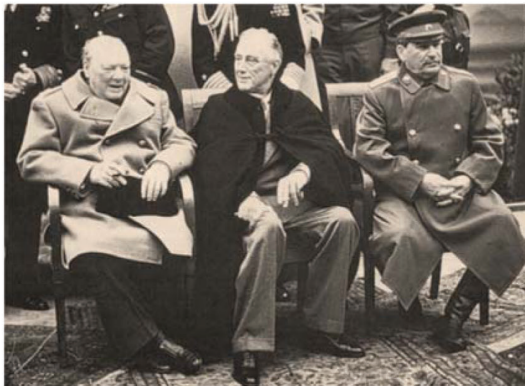
Churchill, Roosevelt and Stalin at the Yalta Conference in February 1945