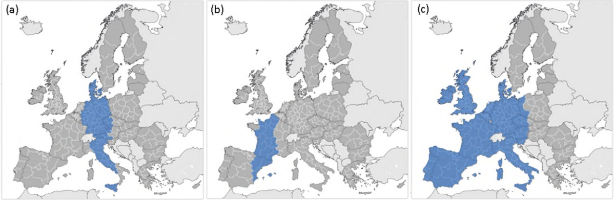
Figure 2 (a) Impact footprint of substorm 21 in the 1-in-10 year scenario (b) Impact footprint of substorm 28 in the 1-in-30 year scenario (c) Impact footprint of substorm 41 in the 1-in-30 year scenario. Figures prepared using www.blackout-simulator.com .