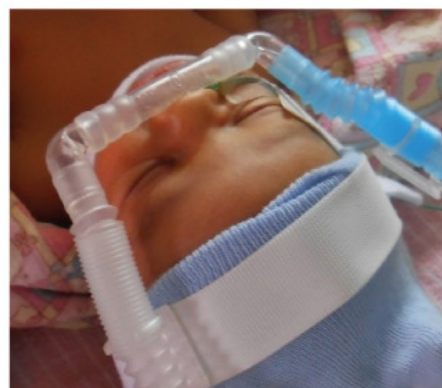
Figure 1 Bubble continuous positive airway pressure (bCPAP) set-up.

'4-2-1 rule' 29 were administered. Isotonic electrolyte solutions (Ringers lactate and dextrose) 30 were used as maintenance fluids. Once vital organ functions were stabilised, 3-hourly NGT feeds were introduced gradually with expressed breast milk for infants, F-75 for children >6 months with SAM. Regarding enteral nutrition of critically ill children without severe acute malnutrition (SAM): Not enough therapeutic nutrition (F75 or F100) was available for the nutrition of critically ill children without SAM. No other specific enteral nutrition was available for this purpose. Therefore ordinary milk products or porridge were used for gastric tube feeding of these critically ill children. In many cases, tolerance of enteral feeds was initially tested with the administration of oral rehydration fluids via NGTs. The maximum volume of enteral feeds administered during this 'critical care phase' for malnourished and non-malnourished children was 100% according to the '4-2-1 rule' 29 .