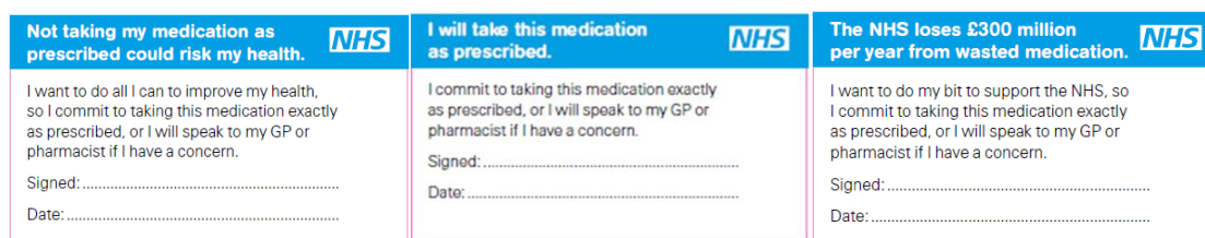
Figure 1. Sticker designs from left to right: personal health costs , commitment only and societal cost . Pharmacists encouraged patients to attach signed stickers to their medication packets.

Pharmacists encouraged patients to attach signed stickers to their medication packets. To manipulate how salient the personal health costs of non-adherence were, we altered the sticker text (see Figure 1). Participants in the no commitment condition did not receive the leaflet which contained this sticker.