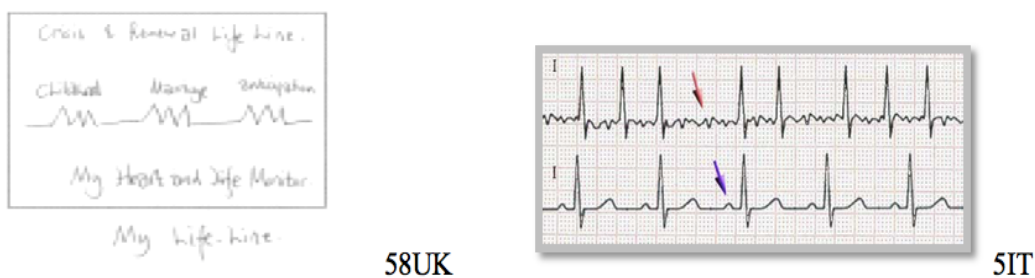
Figure 3: Similar diagrams

These images, sketched as a visual synthesis of a life course, are associated with very different meanings in the narrative accounts. The drawings are not symbolic representations of identity, but pictorial descriptions of the life lived.