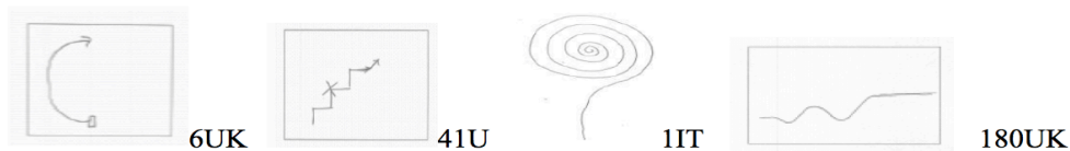
Figure 1: Shapes of life course

Some pairs of diagrams seem to show similar trends (Fig.2). In particular, one English woman (n.18UK) represents her life course as a zig-zag line, making a sketch in which the ups and downs are very pronounced, the amplitude, deepness marking important changes in the last part of the life course and the final arrow an orientation to a future beyond her present situation.. This woman is a nurse and represents herself as an isolated child; one of the downs of her life was the death of the father during her final exams in university. Other important key events coupled to the ups and downs of her life are: becoming a Christian Church member, have a baby (a 'killer milestone'), the mother's death, the faith: 'I would say my life journey is very much interacted with my faith, if it hadn't got a faith on it: it would be a different shape all together [...] if you could say, probably that's a Christian journey'.