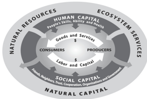
Fig. 1. M. Hart, Sustainable Measures ©