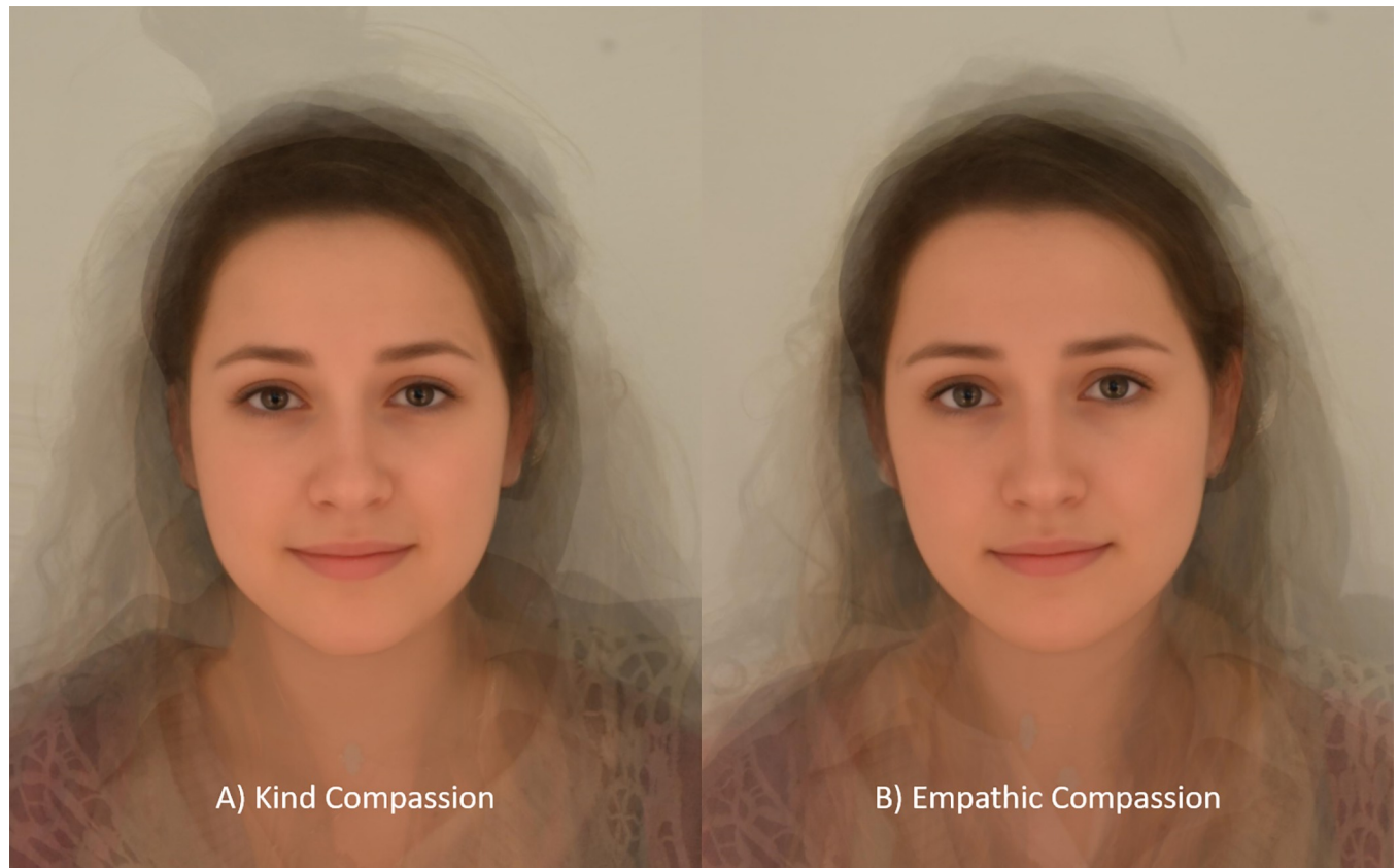
Fig 1. Prototypes of Kind (A) and Empathic (B) Compassion. The composite images are averages of the 10 faces that received the highest compassion ratings.

https://doi.org/10.1371/journal.pone.0210283.g001