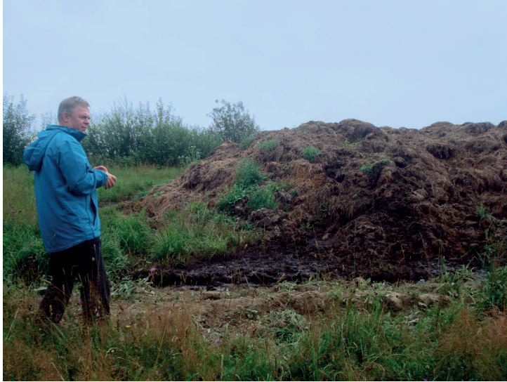
Fig. 20.5 A total of 25 new contamination/contaminated sites were added by schools. Field inspection and evaluation was then carried out by a SEA expert to allow their classification in the ISCS.

Enviróza is intended to update information about selected contaminated sites registered in the Information System of Contaminated Sites (ISCS) and to identify new sites (known as school-identified sites) that display signs of serious contamination. Data gathered by participants is processed by the Slovak Environment Agency (SEA), integrated into the ISCS and thus made available to state authorities as well as professionals and the public.