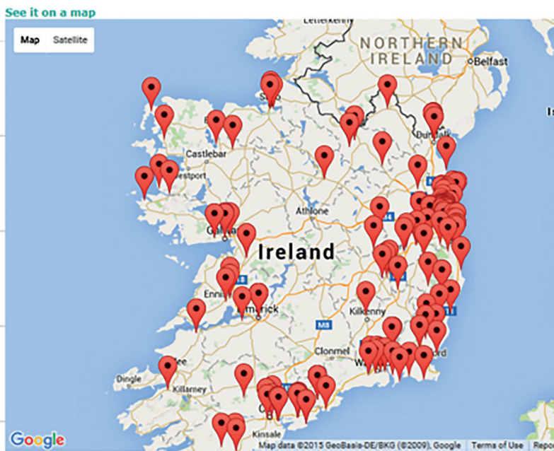
Fig. 20.3 Distribution of reported pollution incidents, summer 2015