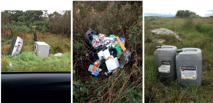
Fig. 20.2 Examples of postings received from all over Ireland in July 2016.