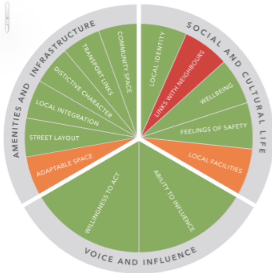
Figure 3 RAG Rating for Kidbrooke Village