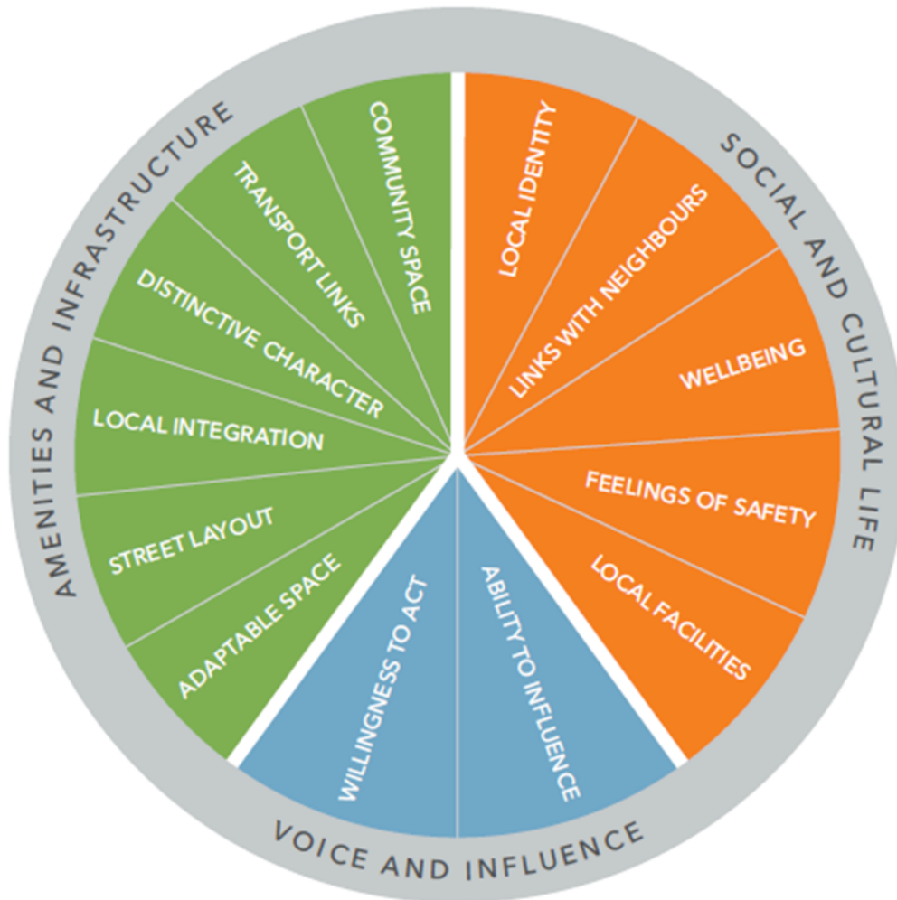
Figure 2: 13 indicators in the social sustainability assessment framework