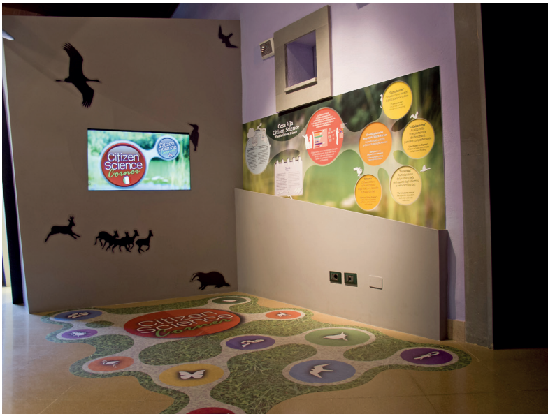
Fig. 2.1 The Museo di Storia Naturale della Maremma (Natural History Museum of Maremma, Italy) displays the Ten Principles of Citizen Science in their 'Citizen Science Corner' gallery to inspire visitors to participate in local projects.