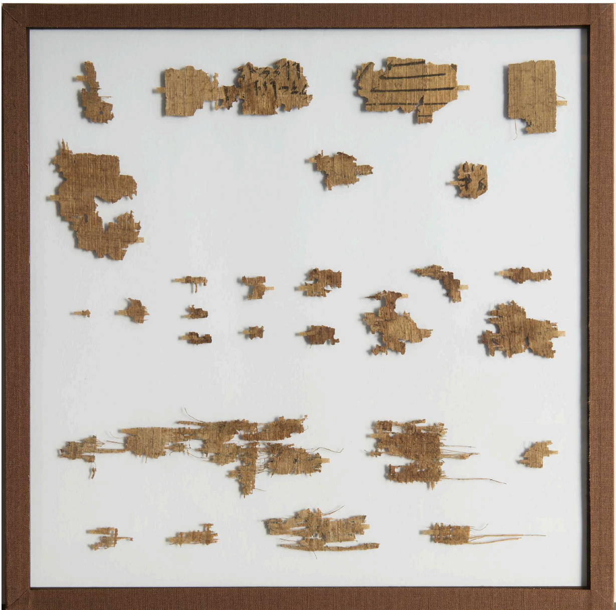
Fig. 2: Papyrus fragments UC71095 after conservation: side with vertical fibres uppermost.