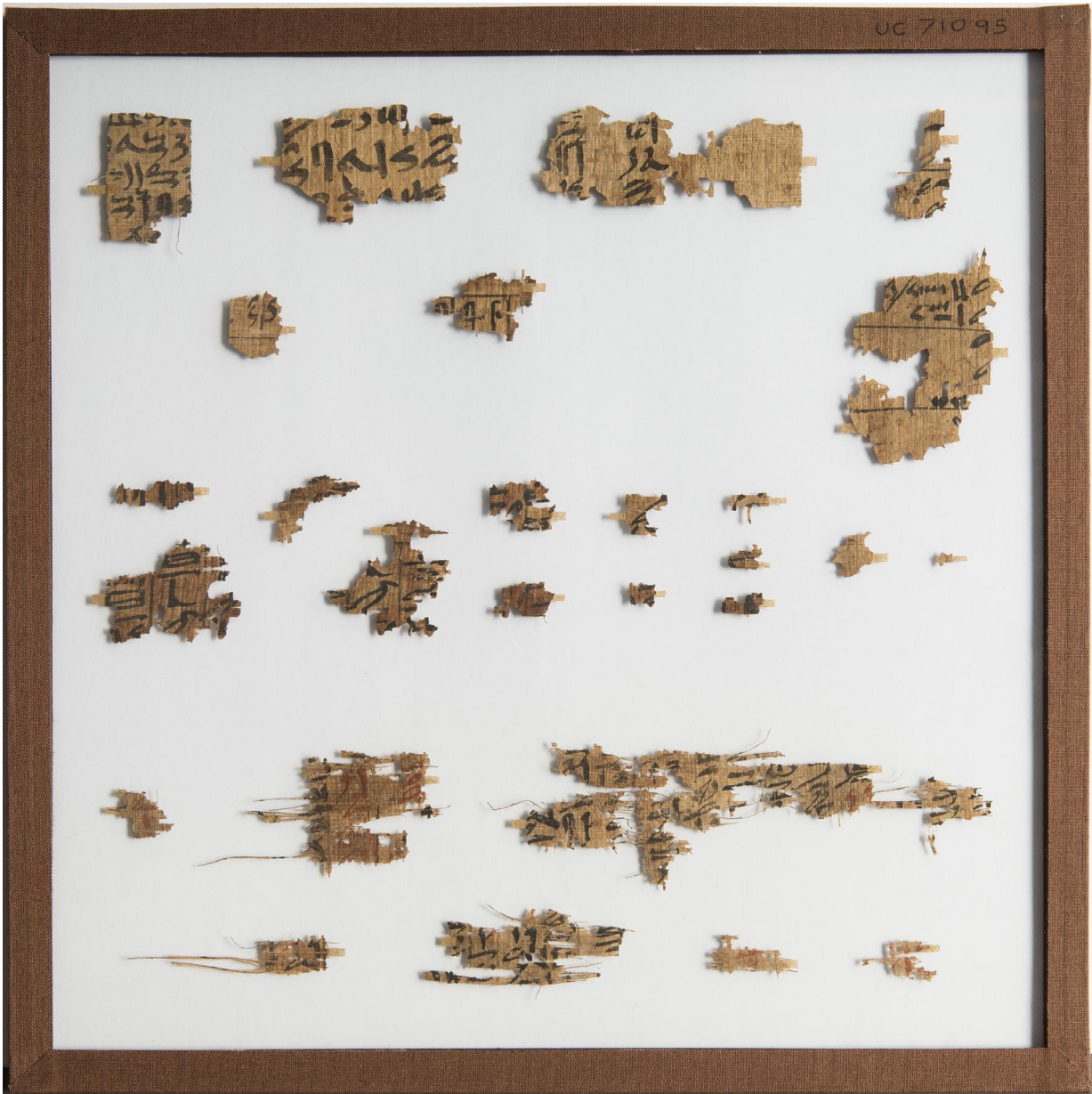
Fig. 1: Papyrus fragments UC71095 after conservation: side with horizontal fibres uppermost.