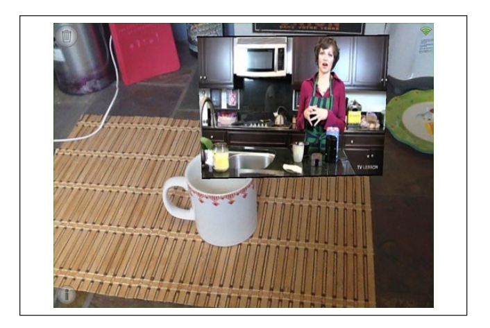
Figure 2. Aurasma used to teach about making coffee.

based on student performance when practicing using the app. AR Basketball is a great example of how AR is part of the expanding field of educational gaming (McMahon, 2015).