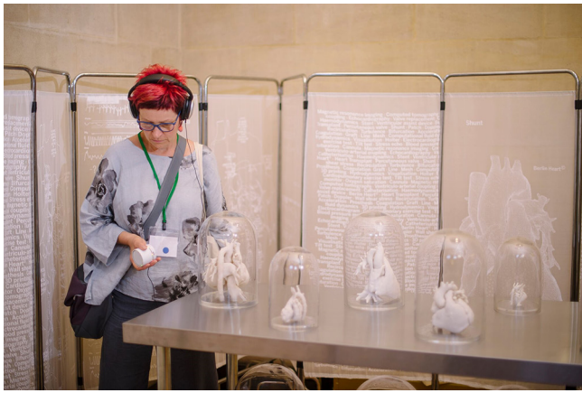
Figure 2 Visitors could listen to the soundscape on headphones for a more immersive experience.

free-text questions. It was administered before and after a viewer had experienced the piece, including the soundscape. Two researchers were always present, invigilating the artwork and collecting questionnaires from the viewers, as well as helping them to set up the headphones and answering any questions they may have on the genesis of the piece or on the 3D heart models.