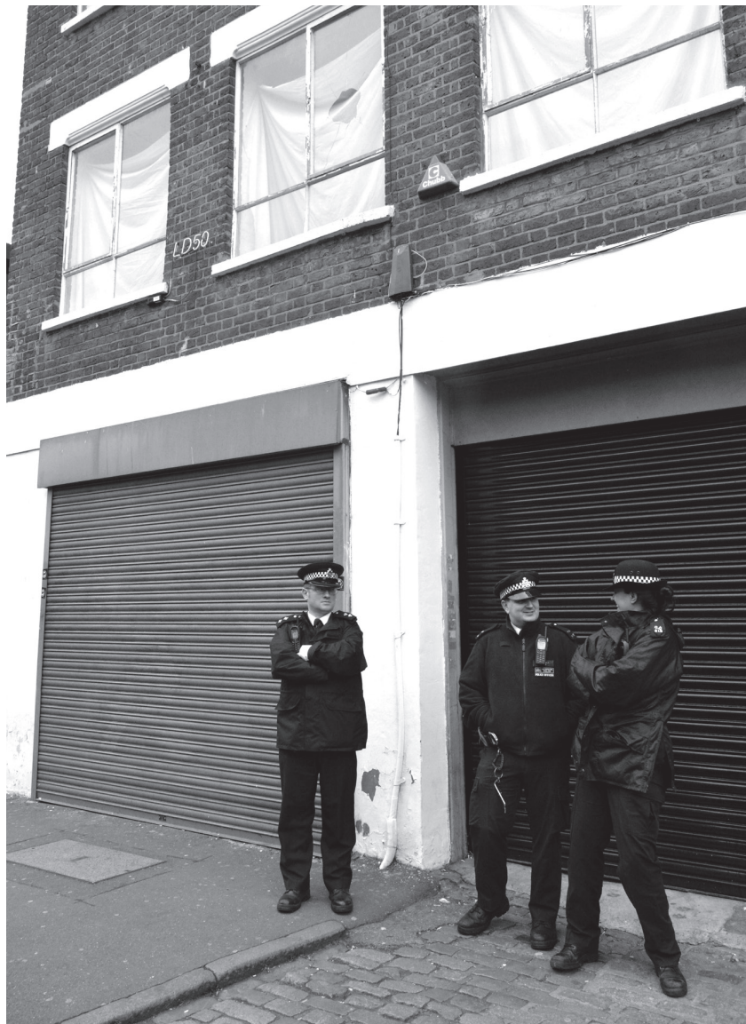
police guarding the entrance to LD50 gallery in Hackney during the anti-fascist protest on 25 February