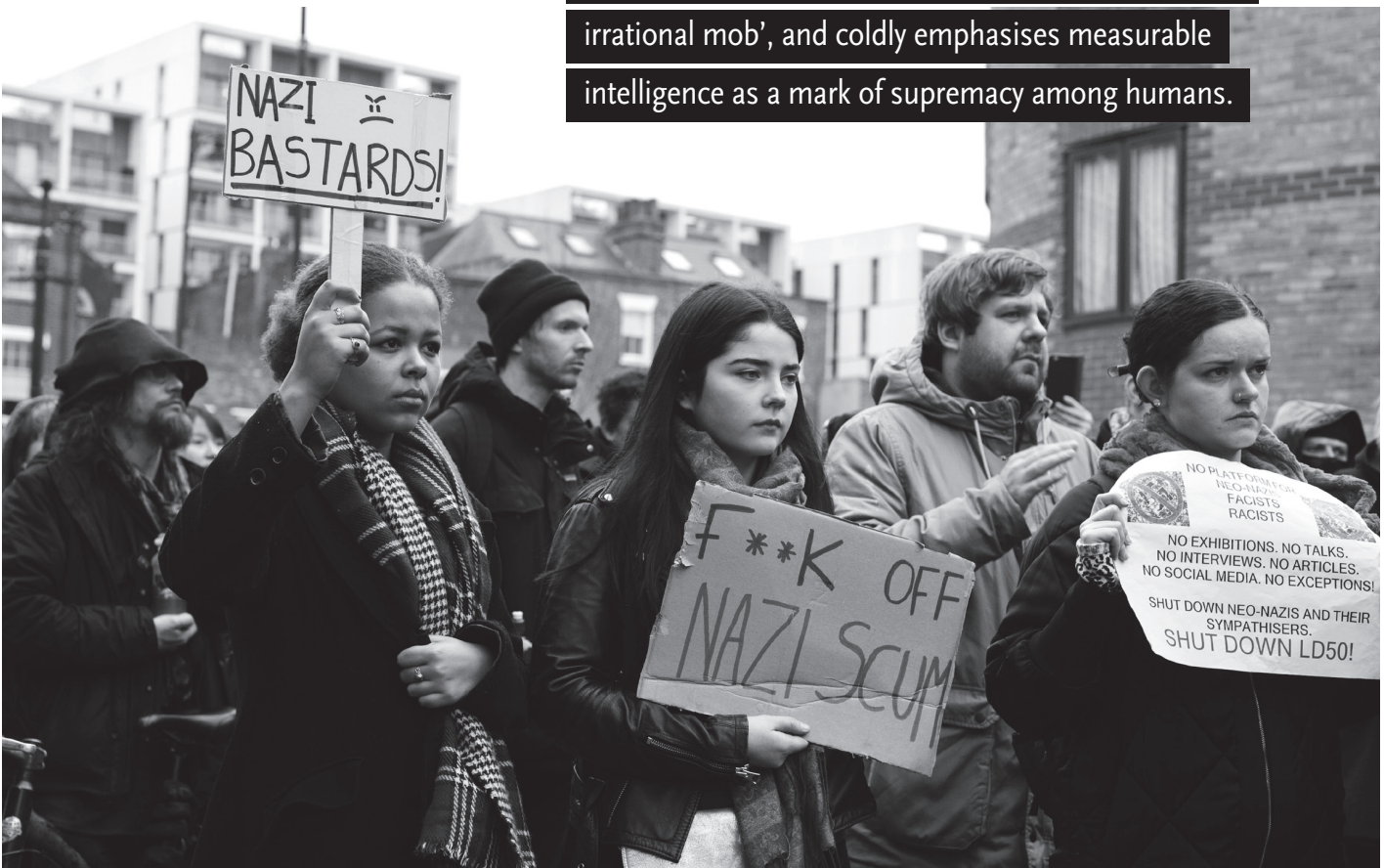
anti-fascist protest outside LD50 gallery in Hackney, 25 February

Nick Land's exceptionally turgid text 'The Dark Enlightenment' describes the 2012 Trayvon Martin murder as 'too good to be true' for progressives, decries the 'politically awakened masses as a howling irrational mob', and coldly emphasises measurable intelligence as a mark of supremacy among humans.