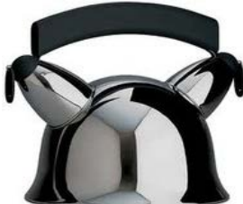
Mama O' teakettle by Andrea Branzi