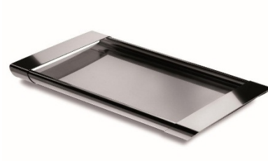
Tiffany tray by Silvio Coppola (Program 7)