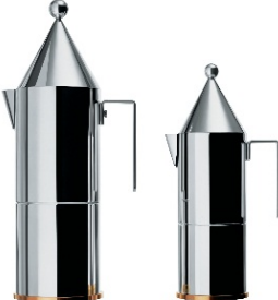
La Conica coffee makers by Aldo Rossi