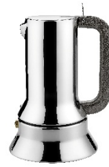
9090 coffee maker by Richard Sapper (Program 9)