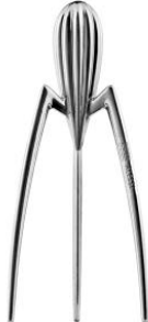
Juicy Salif lemon squeezer by Philippe Starck