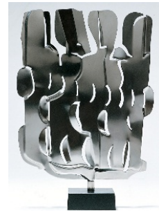
Rotating by Pietro Consagra