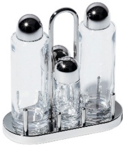
5070 oil cruets by Ettore Sottsass (Program 5)