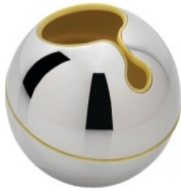
Guscio N. 1 by Giò Pomodoro