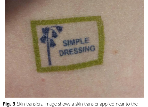
Fig. 3 Skin transfers. Image shows a skin transfer applied near to the wound(s) to promote adherence to the randomised dressing allocation

of randomisation. This information, together with the denominator describing the total number of participants approached, will establish whether recruitment into the main trial is possible.