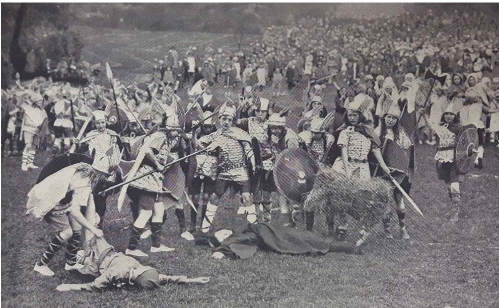
Figure 1. Children performing in the Preston historical pageant, 1922. Source: A.J. Berry, Preston Gild 1922: Historical Pageant (Preston: George Toulmin and Sons, [edition-de-luxe] 1923), 45.

The educational agenda evident in the Alfred millenary – and in the historical pageants that followed hot on its heels – persisted into the post-war years, and indeed was amplified further. Pageants grew in scale, becoming still more popular with schools, and increasing numbers of schoolchildren were involved as performers. Perhaps the most striking indication of this was the Preston historical pageant of 1922, which saw the participation of no fewer than 11,000 local children and was organised on a voluntary basis by local schoolteachers. Figure 1 shows pupils of the Deepdale Council School re-enacting ‘the onslaught of the Danes’, in which the raiding Vikings burn down a church and rob a priest of the tithes his