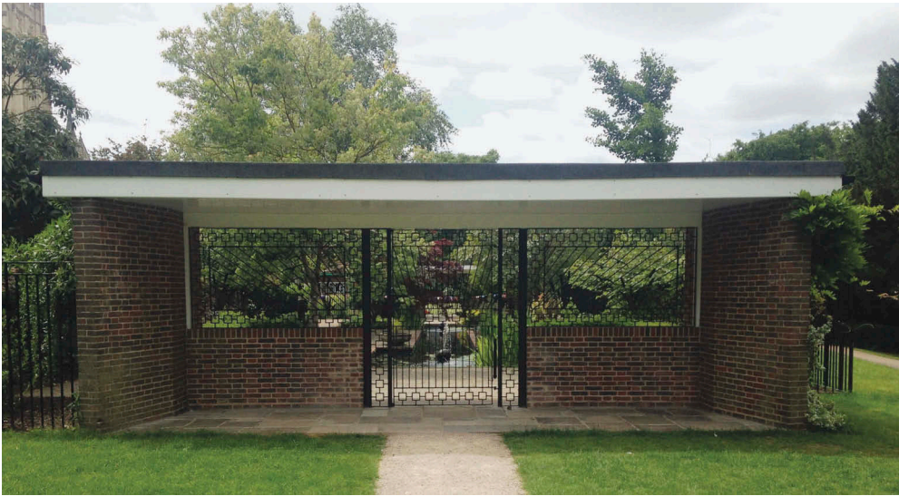
Figure 3. Memorial to the Bury St Edmunds pageant of 1959, in the abbey gardens.

generated by the 1959 Bury St Edmunds pageant paid for an ornamental water garden and a public shelter, which was installed in the abbey gardens (see Figure 3 ). 108 There are streets named after pageants in Sherborne, Bridport, Framlingham and St Albans; and Arbroath has a pub called ‘The Pageant’. Often – as at Sherborne – the profits were used for a local charitable purpose, or to help restore or safeguard an historic building; thus pageants helped to give new meanings to place. Smith has argued that ‘places receive heritage values as they are taken up in national or sub-national performances of identity and memory-making’, 109 and pageants were among the most spectacular of such ‘performances’ – quite literally. Many historical properties display ephemera from pageants held on-site in the past: examples include Framlingham Castle and Battle Abbey. Pageants, which did much to provoke interest in local history, have also themselves prompted much local historical research, sometimes – though often not – connected to the Redress of the Past project. 110 In 2014, local historian Philip Sheail published a book to mark the centenary of the Hertford pageant, and this was launched at an event at which the mayor of Hertford spoke, and at which a local choir, the Mimram Singers, performed music from the pageant itself. 111 Events held in