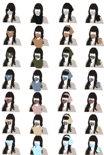
Figure 5: With a strong idea what the mask should do and some impressions of what it might look like we made simple sketches that became more and more detailed as the project progressed. Putting the mask on a body posed more questions for us: Where could it sit without being too annoying when not in use? How would it open up? How large could/should it be? We experimented with a lot of ideas, some of which are displayed here.

observed and made notes on peoples' conversations when interacting with the mask, which formed the basis for the following reflections.