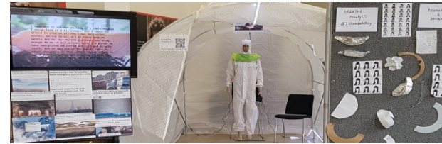
Figure 4: Deployment at festival showing the TV screen to the left with three design fictions of potential mechanic or symbiotic masks. Air pollution news headlines for London were below the TV. In the center of the display is the mannequin in a white plastic tent wearing the mask. To the right are early physical prototypes and sketches from ideation sessions.