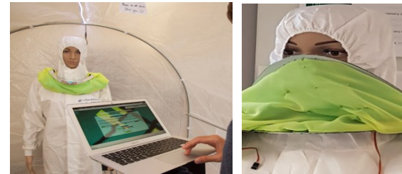
Figure 3: (left) Mannequin wearing mask in closed position; laptop showing user interface to control air pollution levels. (right) Mask in open position.

We exhibited our first prototype at a local festival, where we used a Wizard of Oz approach through which the users could experiment with the mask functionality based on air pollution values, instead of using air pollution sensors to actuate the mask; this explained the function of the mask to the viewer without actually having to move around the city to experience varying pollution levels. Despite the Wizard of Oz approach, it was important that the user did not have direct control of the mask (for example, by pressing a button to change the mask state), but rather could experience the mask being controlled through air pollution values. Therefore, we created an accompanying Bluetooth Low Energy web interface, which controlled the mask state (Figure 3, left) depending on users' input of an air pollution value in line with the Air Quality Index [5]. For example, dangerously high pollution levels actuated a rapid opening of the mask to cover the mannequin's nose, while low values returned it to the collar state.